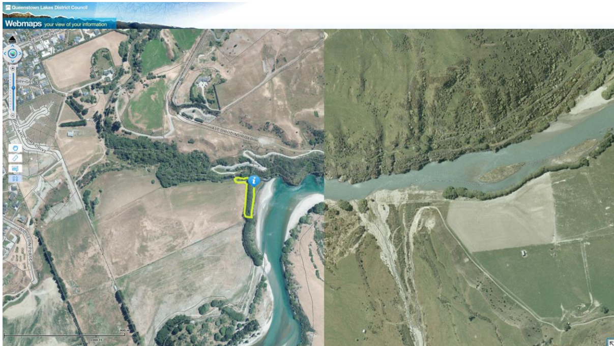
Figure 1 – Lot 1 DP 447906 Highlighted in Yellow.

The overall cover letter for the Designations Chapter work includes a web link which will enable interested parties to view this change on the proposed planning maps.