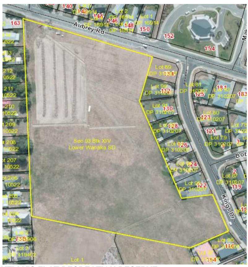
KELLY'S FLAT RECREATION RESERVE