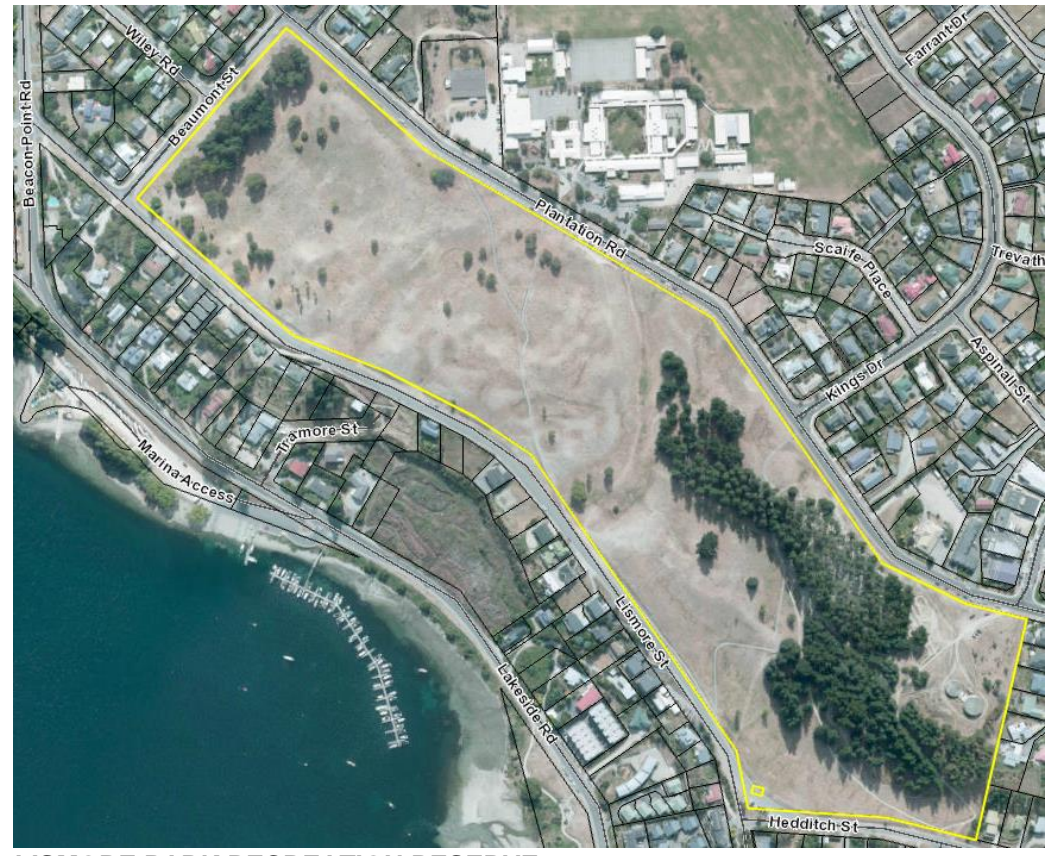
LISMORE PARK RECREATION RESERVE