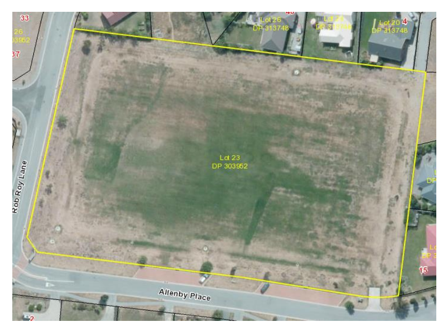
ALLENBY PARK RECREATION RESERVE