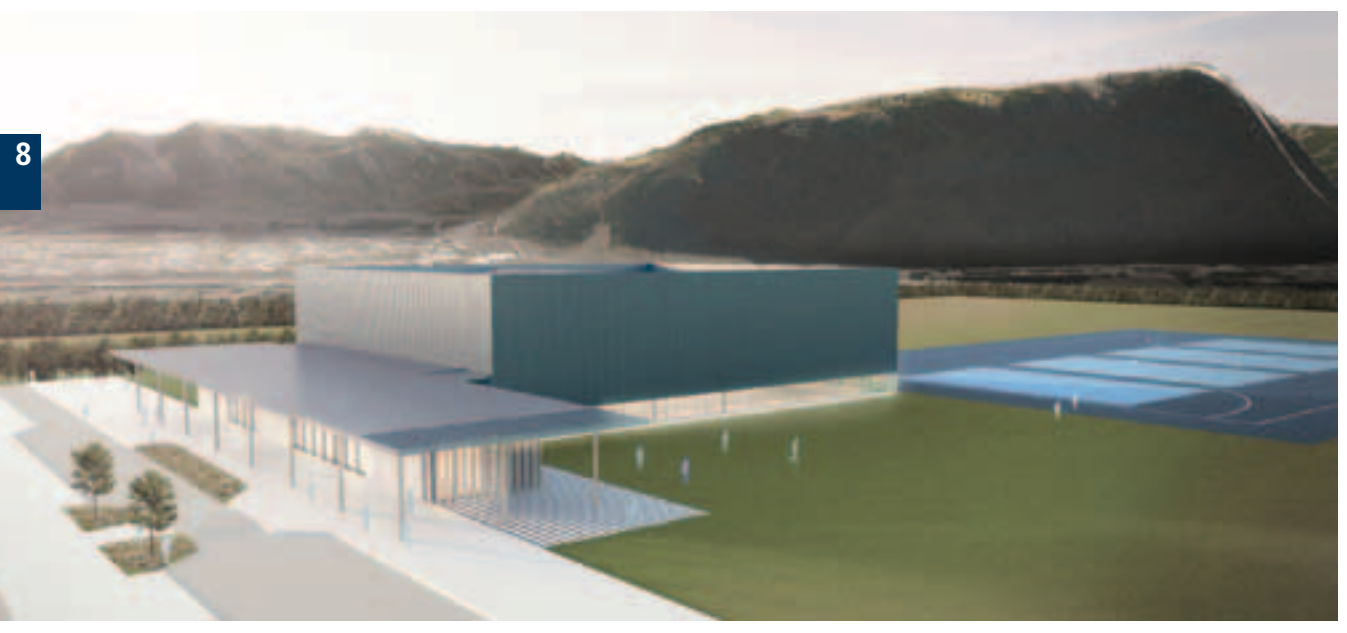
An artist's impression of the Wanaka Sports Facility

There is a risk that a law change will prevent us from using development contributions to help pay for about a third of the Wanaka Sports Facility. This would increase the cost to ratepayers by about $3.5 million.