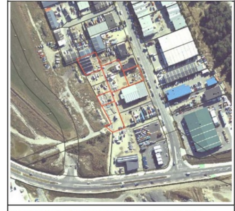
Aerial photo of subject site showing area of re-zoning request of M Space Partnership Ltd outlined in red.