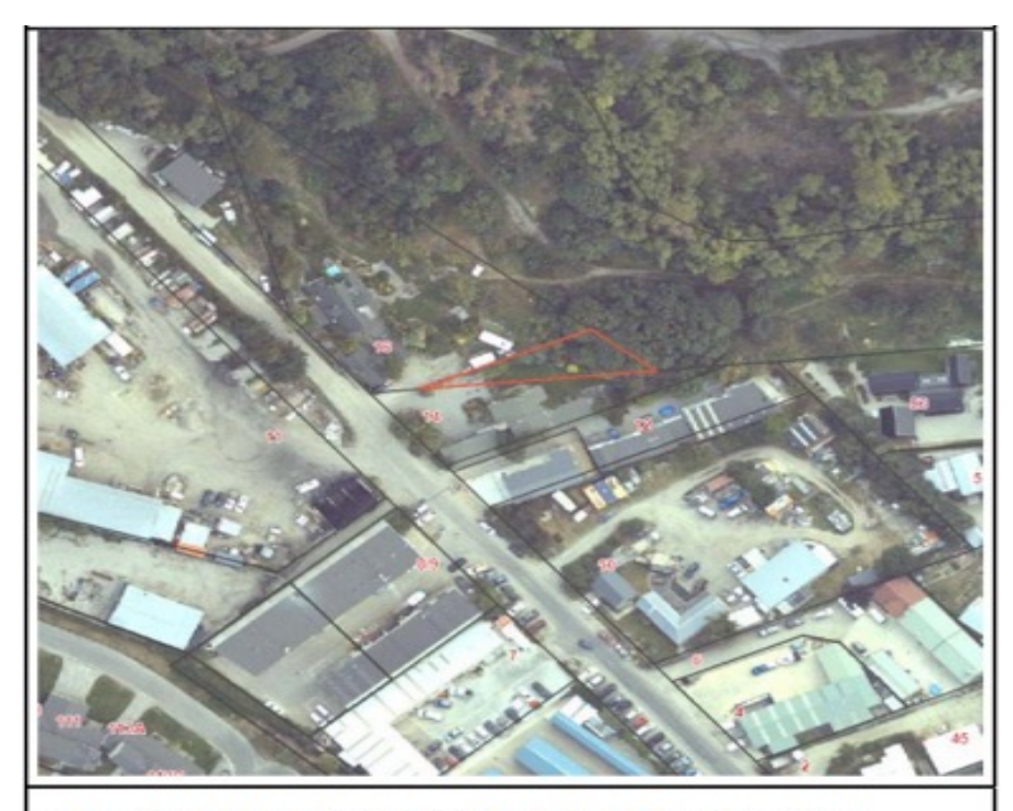
Aerial photo of subject site showing area of the M Thomas re-zoning request outlined in red.