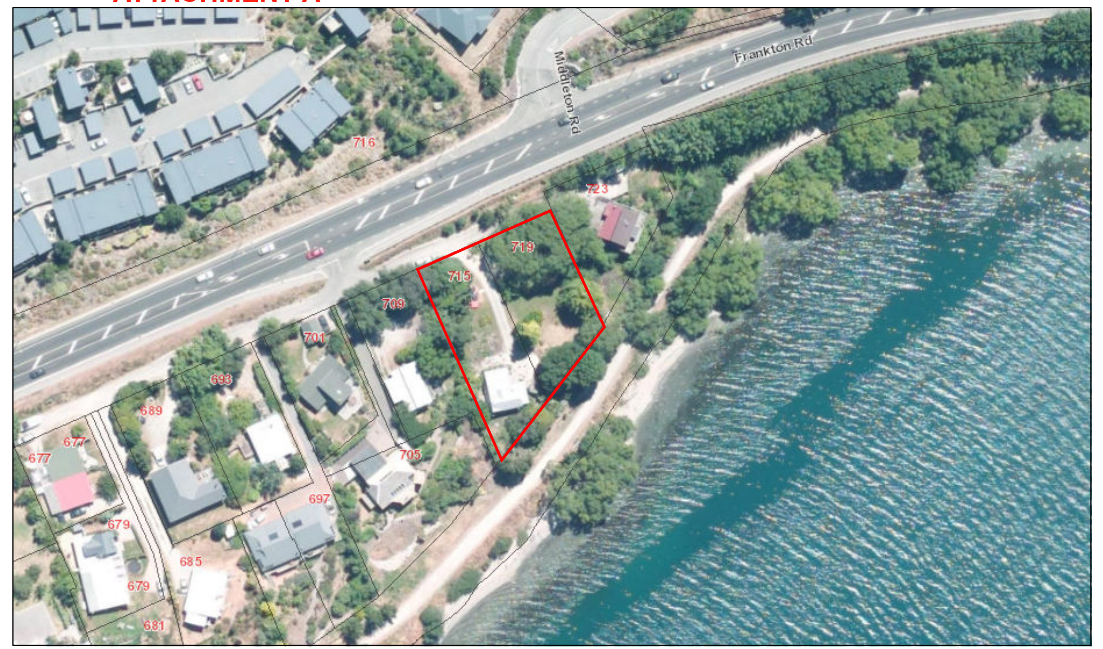
The map is an approximate representation only and must not be used to determine the location or size of items shown, or to identify legal boundaries. To the extent permitted by law, the Queenstown Lakes District Council, their employees, agents and contractors will not be liable for any costs, damages or loss suffered as a result of the data or plan, and no warranty of any kind is given as to the accuracy or completeness of the information represented by the GIS data. While reasonable use is permitted and encouraged, all data is copyright reserved by Queenstown Lakes District Council. Cadastral information derived from Land Information New Zealand. CROWN COPYRIGHT RESERVED