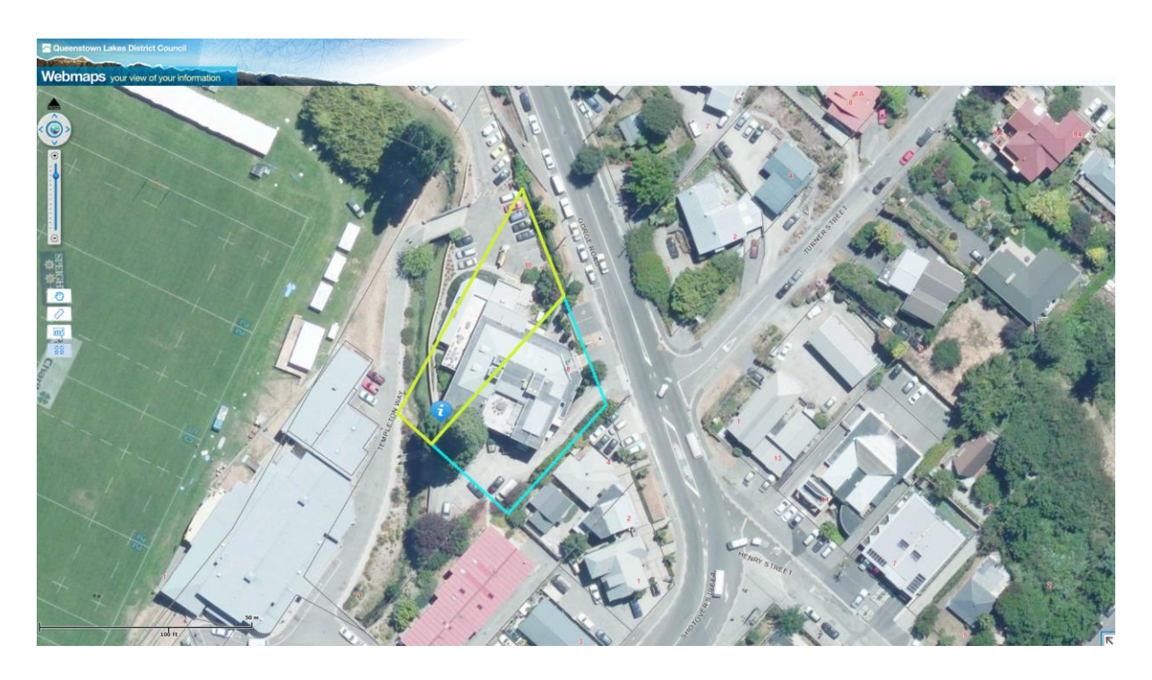
Figure 2 – Section 4 Shown in Yellow Section 5 Shown in Blue. Source – QLDC Website 23.03.15