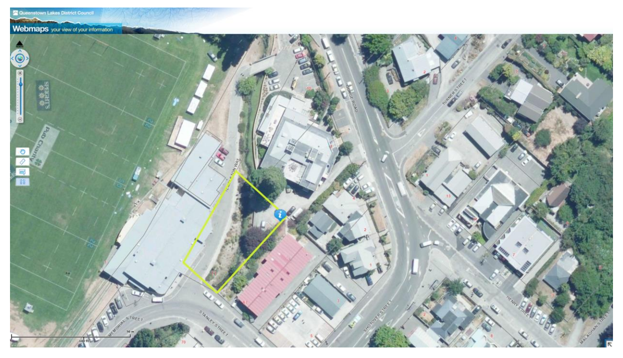
Figure 1 – Section 3 Shown in Yellow.