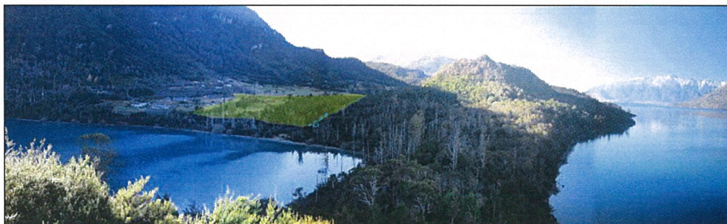
Figure 4 Photo from Appendix A in Appendix 5 of the Glentui Heights Subdivision decision overlaid with approximate location of the proposed site