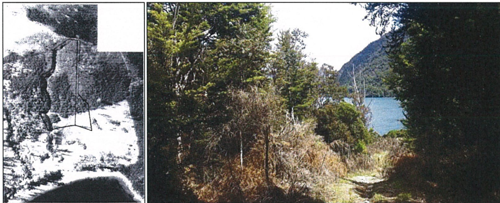
Figure 3 [left] Aerial photo of site area showing application site area (date of photo unknown, estimated to be 1970s) [right] Photo taken November 2015 towards application site on left foreground and the Wapiti Block on right foreground