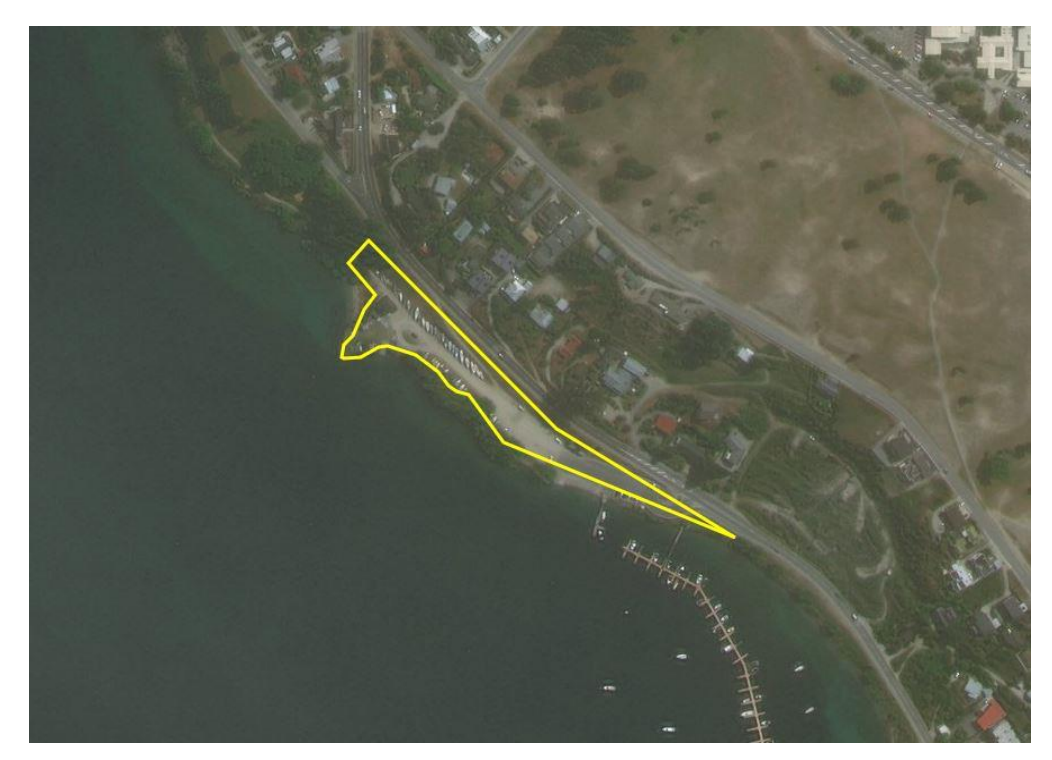
Figure 1: Map of Wanaka Yacht Club and Wanaka Marina

3.2 As such, the existing recreational activity does not occur within the notified informal recreation open space zone. Given this, and the special character of the lake margin, I still maintain that Informal Recreation Zone is more appropriate.