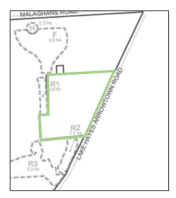
Figure 3: MRZ activity areas surrounding the submitter's land (identified in green)

to R3 on the Millbrook Resort Zone Structure Plan<sup>1</sup>. Surrounding these Residential activity areas is the 'Golf/Open Space activity area (G).