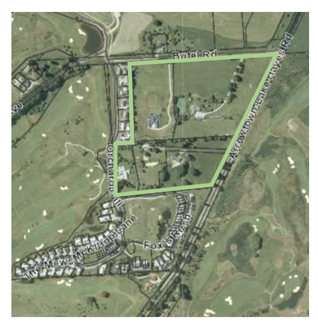
Figure 4: Location of MRZ Residential activity areas surrounding the submitter's land