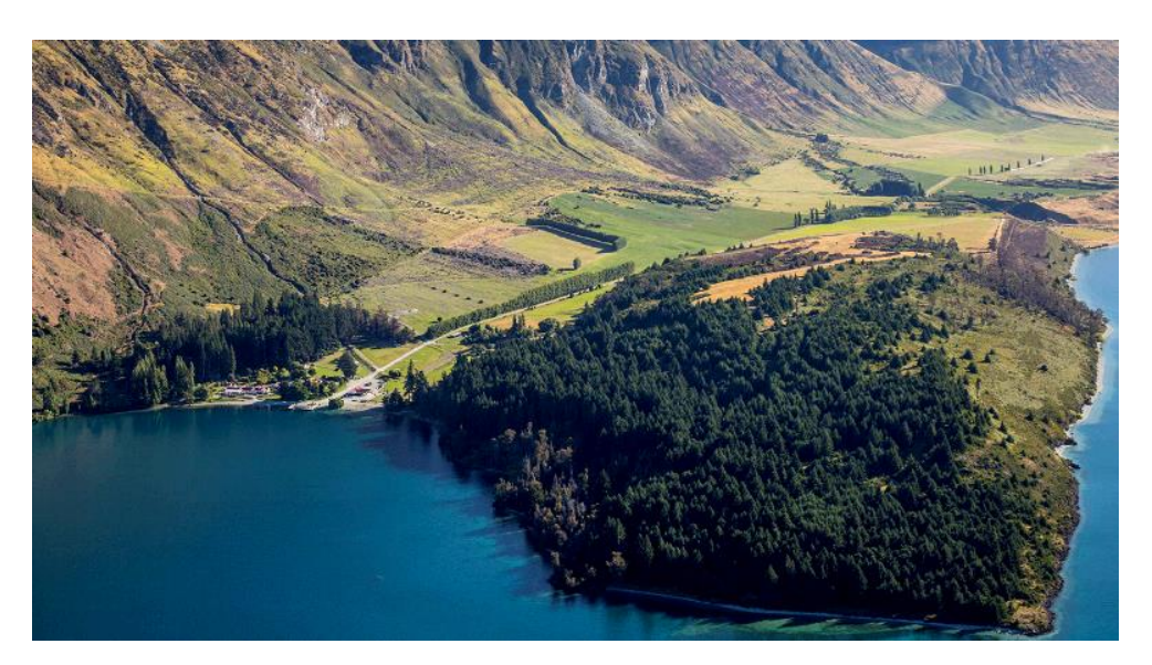
Figure 10 Photo of Walter Peak from early 2015

are more to come throughout the 115ha property. I believe such restoration projects should be able to proceed without the need for Resource Consent.