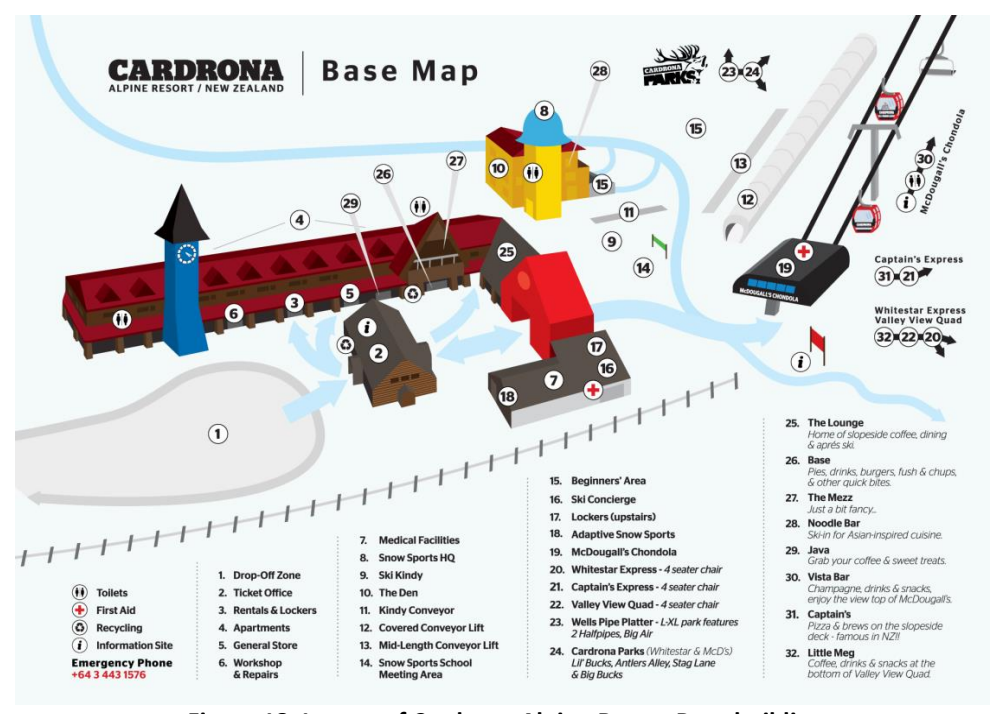
Figure 18. Layout of Cardrona Alpine Resort Base buildings