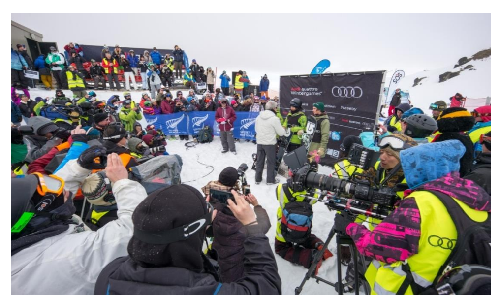
Figure 16. Photos of events at Cardrona Alpine Resort

Real Journeys generally supports the new signage objectives and policies being recommended for the s.42A Report for the SASZ. However, I contend the PDP provisions should unambiguously permit temporary and sponsorship signage. Cardrona Alpine Resort hosts mainly sport events which are sponsored and for these sponsors to get the benefit of this sponsorship the event needs to profile the sponsor. This is typically done through extensive temporary signage which is then seen in media coverage of the event. <sup>13</sup> Refer photos below.