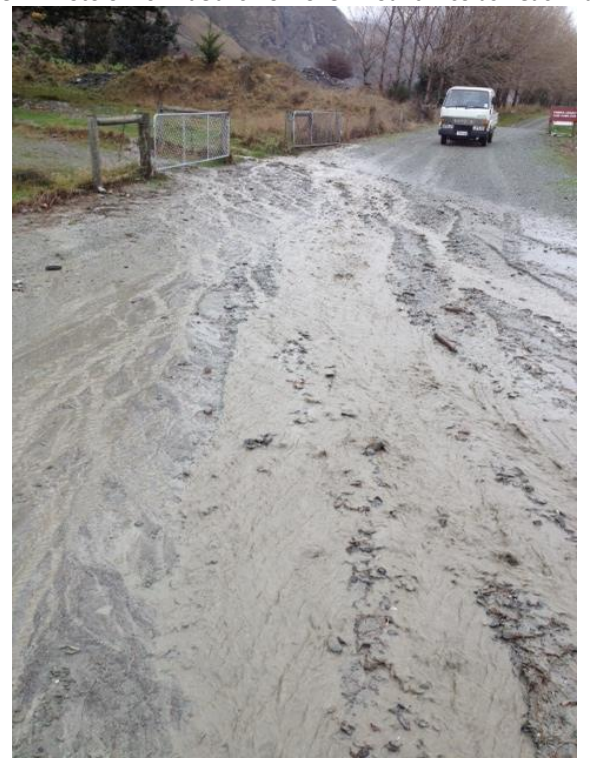
Figure 4. Photo of 2014 debris flow over Mount Nicolas Beach Bay Rd

33 Te Anau Developments holds a Department of Conservation Concession to construct rock culverts and rock armouring, undertake stream deepening and tree planting as part of flood protection programme in the Beach Bay Recreation Reserve.