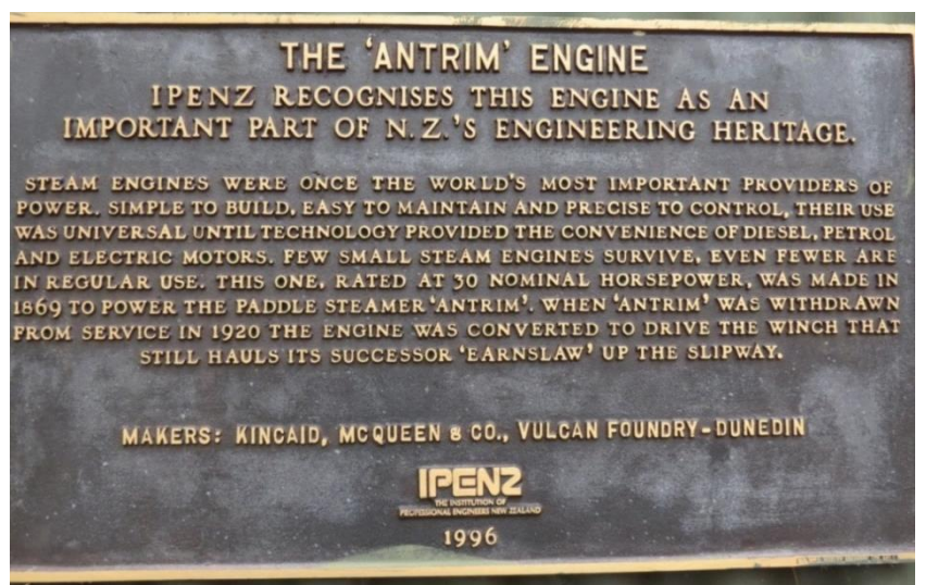
Figure 15. IPENZ Plaque commemorating the "Antrim" Steam Engine (on public land)

The photo below shows another example of interpretation signage on public land, established by a private organisation (IPENZ), which I think should be enabled by the signage provisions.