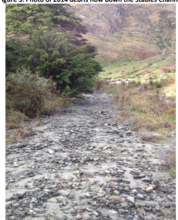
Figure 3. Photo of 2014 debris flow down the Stables Channel

Figure 4. Photo of 2014 debris flow over Mount Nicolas Beach Bay Rd