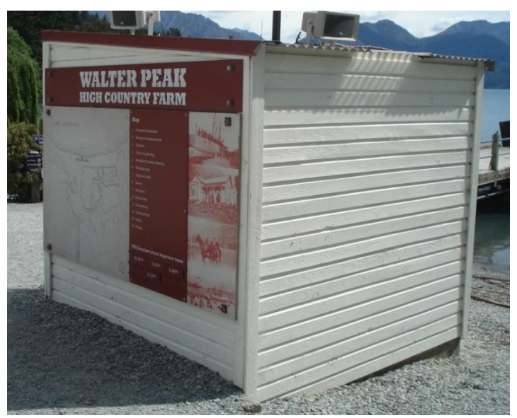
Figure 13 Photo of utility shed at Walter Peak with information signage