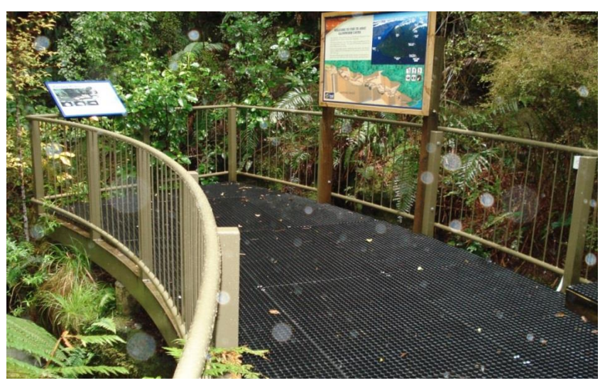
Figure 14. Photo of one of the viewing platforms at Te Anau Caves

The photo below shows another example of interpretation signage on public land, established by a private organisation (IPENZ), which I think should be enabled by the signage provisions.