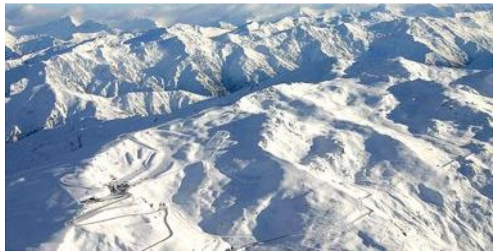
Figure 6. Cardrona Alpine Resort (winter snow cover)