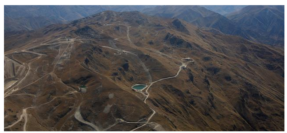
Figure 5. Cardrona Alpine Resort (summer)