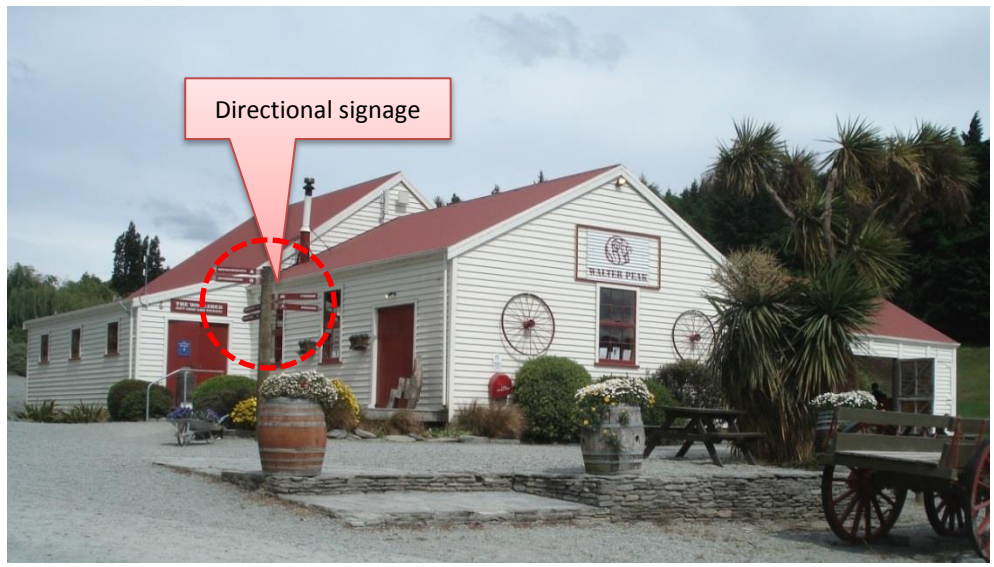
Figure 12 Photo of the woolshed at Walter Peak