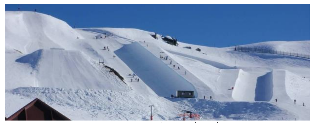
Figure 8. Terrain Park Features (winter)