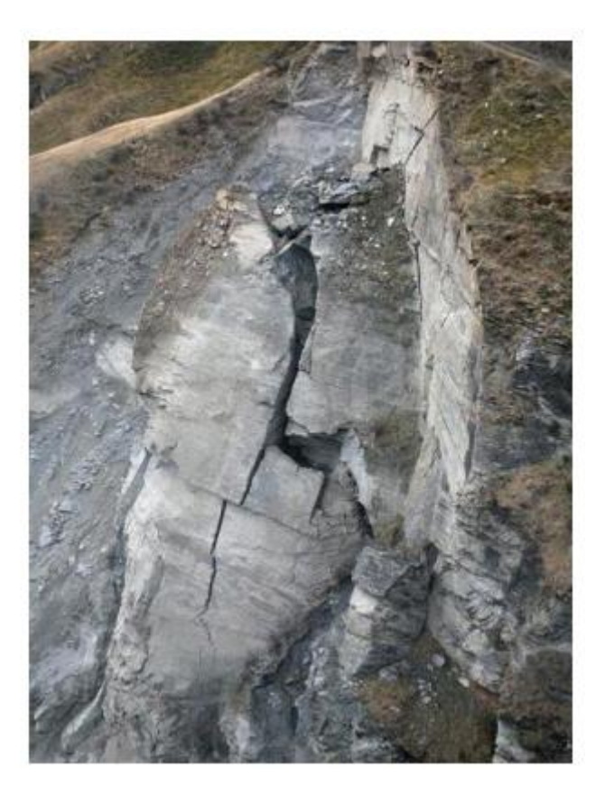
Figure 9. Photo of the 2008 slip before it was released by water jacking

Our request for Rule 25.3.4.5(f) to be amended (to apply to planting generally rather than only exempting earthworks associated with the planting of riparian vegetation) relates primarily to the example of the Walter Peak Restoration Project (refer figures below). So far as part of the project over 12,000 native trees and shrubs have been planted and there