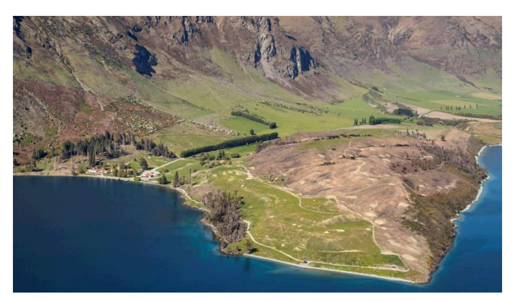
Figure 11 Photo of Walter Peak from 2016