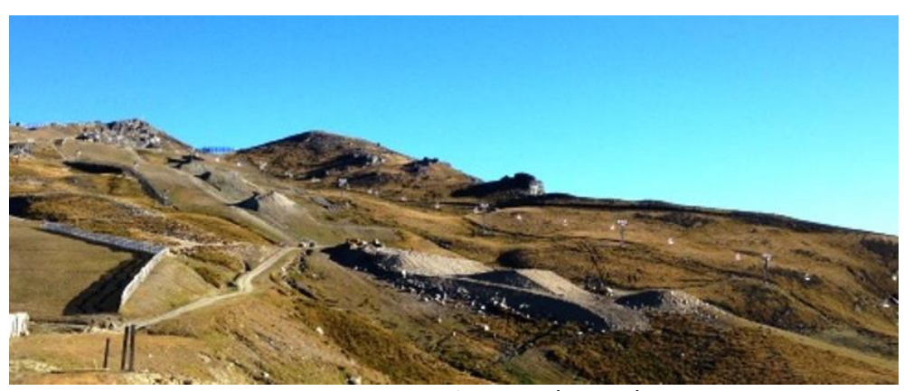
Figure 7. Terrain Park Features (summer)