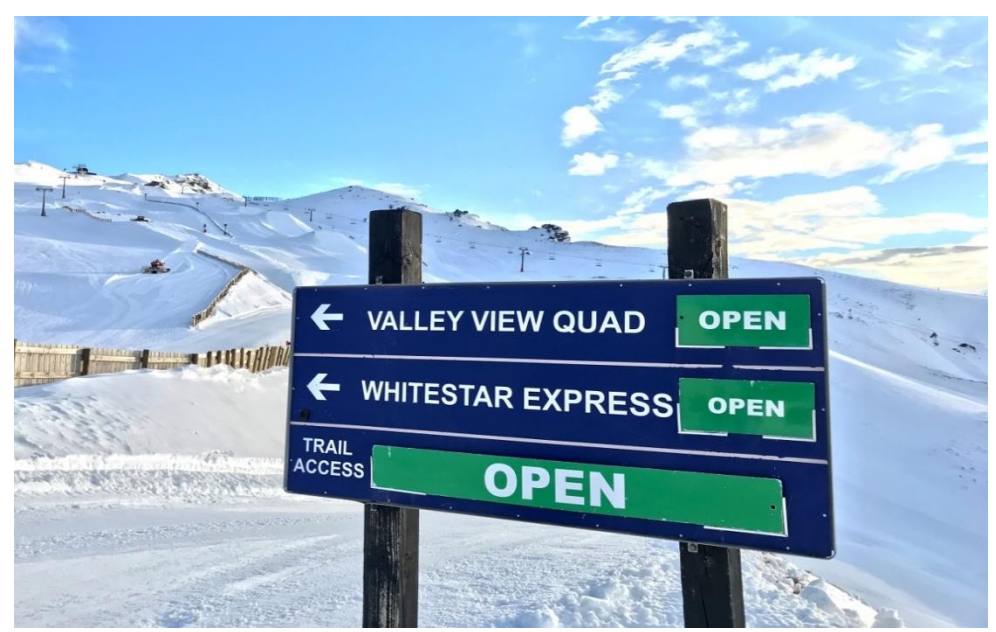
Figure 17. Photo of directional Signage at Cardrona Alpine Resort