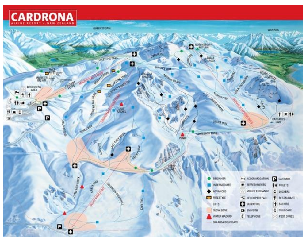
Figure 19. Mountain Route Map