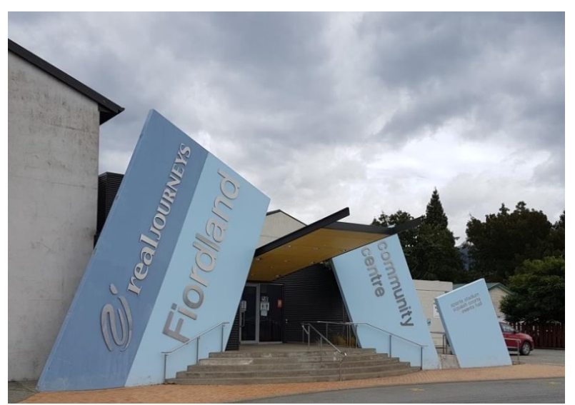
Figure 22. Photo of Fiordland Community Events Centre in Te Anau