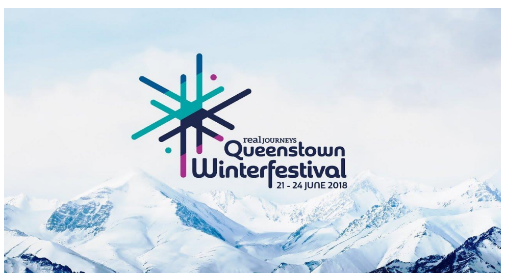
Figure 20. Winter Festival Banner

In fact I have done a scale drawing for sign of 2m<sup>2</sup> area with 120mm height text (refer below) which provides the minimum information regarding the winter festival. This demonstrates how unworkable these proposed standards are in terms of providing for effective marketing tools.