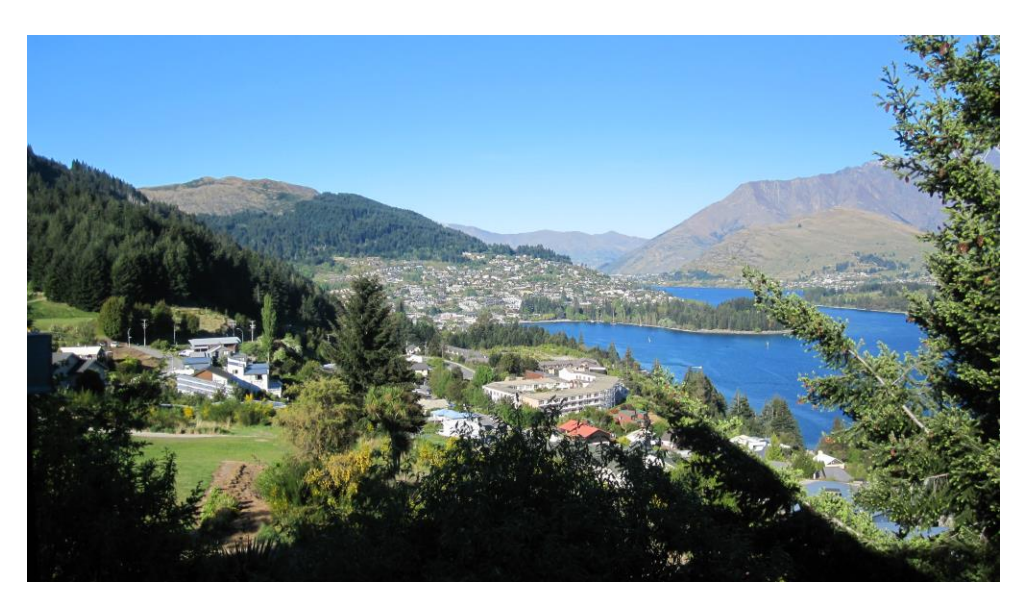
Figure 3: View from 14 Richards Park Lane showing the land below the Aspen Hotel restaurant. [Photograph taken January 2018 by Inga Smith.]