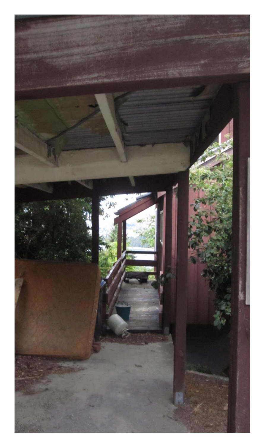
Figure 5: View of the front of 12 Richards Park Lane, photograph taken from the street. An old mattress, LPG cylinder, and printer can be seen sitting in the carport and ramp. I understand that these items and other waste/rubbish that litter the section below the house had been there for at least two years and were left by previous tenants when the owners (Aspen Hotel) ceased to rent out the house. [Photograph taken January 2018 by Inga Smith.]