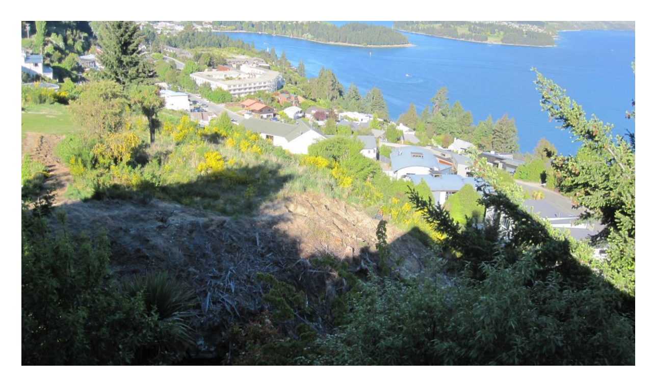
Figure 4: Zoomed in view from 14 Richards Park Lane showing the land below the Aspen Hotel restaurant. Debris can be seen where plantings have been removed at the top of the steep-walled gully by the hotel owners within the last two years.