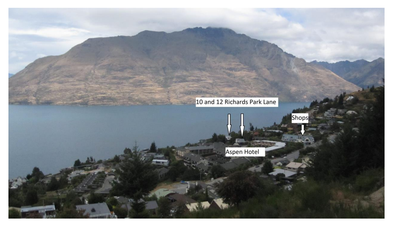
Figure 2: View from Wynyard Crescent showing Richards Park Lane and surrounding areas in Fernhill. The approximate locations of the Aspen Hotel, shops (corner shopping complex, presently containing a dairy, takeaway food outlet and small restaurant) and houses at 10 and 12 Richards Park Lane are indicated.