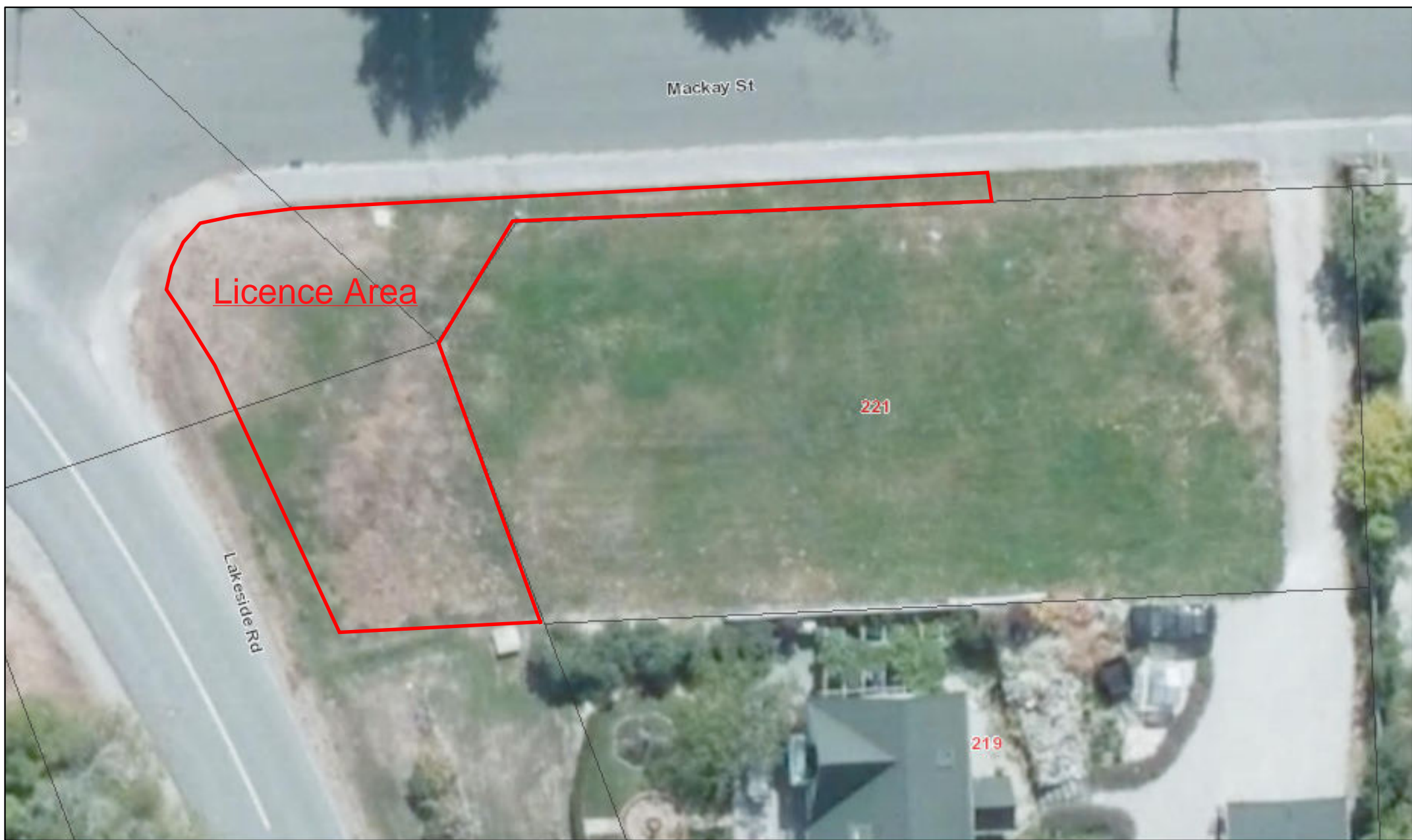
The map is an approximate representation only and must not be used to determine the location or size of items shown, or to identify legal boundaries. To the extent permitted by law, the Queenstown Lakes District Council, their employees, agents and contractors will not be liable for any costs, damages or loss suffered as a result of the data or plan, and no warranty of any kind is given as to the accuracy or completeness of the information represented by the GIS data. While reasonable use is permitted and encouraged, all data is copyright reserved by Queenstown Lakes District Council. Cadastral information derived from Land Information New Zealand. CROWN COPYRIGHT RESERVED