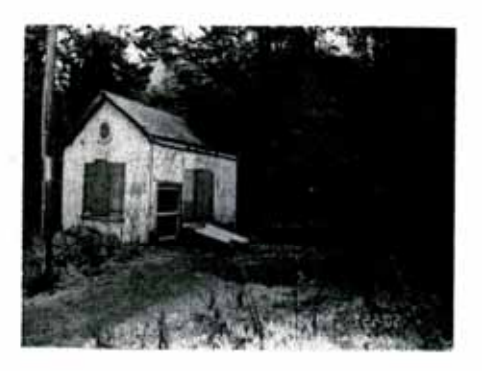
View from southern approach showing Powerhouse and adjoining concrete slab and upstand

(Malcom Boote, and the Queenstown and Lakes District Historical Society, have more detailed information regarding generating plant itself.)