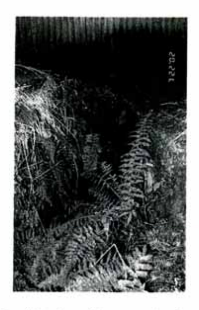
Detail showing spillway emerging from Under Western wall

[1] See Conservation Plan for Eichardt's Hotel, Salmond Reed Architects, 2001, pp 10-12.