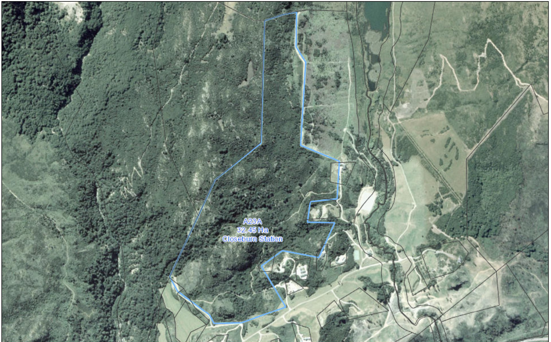
Figure 1: The area of potential significance - Closeburn SNA A - A23A.