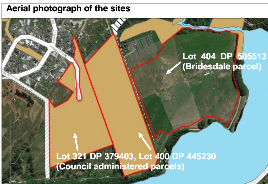
Figure 1: Aerial photo showing land subject of submission 2391 outlined in red, and open space zoning as notified in Stage 2 (tan = IRZ)

10.1 Mr Edmonds has filed evidence on behalf of Bridesdale Farm Developments Ltd in relation to the rezoning request for land located on south of Lake Hayes Estate and Shotover Country. The land and zoning requested is set out in Figure 1 .