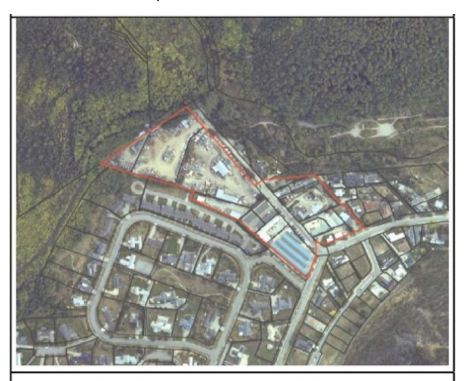
Aerial photo of subject site showing area of the submitter's re-zoning request outlined in red.