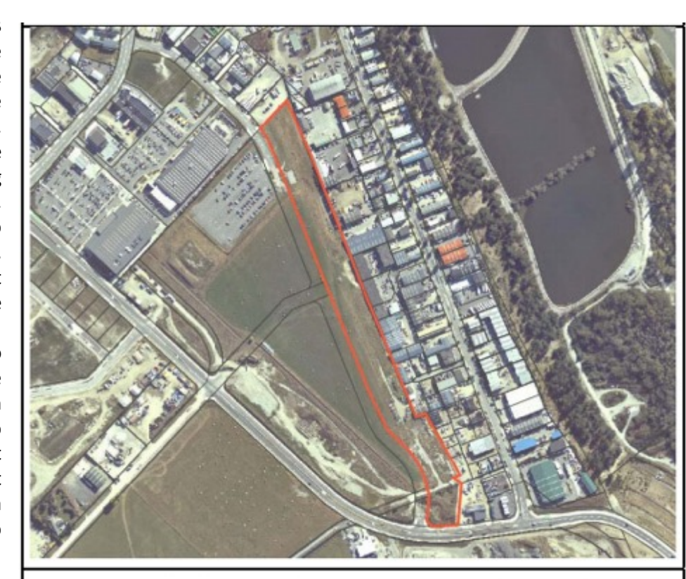
Aerial photo of subject site showing area of the QAC re-zoning request outlined in red.

221. In terms of the Frankton Flats B zone, this would bring the affected part of the Site into line with the zone that applies to the majority of the submitter's site. This is a zone that Mr. Place highlights as not to date having been carried into the PDP. Amongst other things, this also means that its objectives, policies and methods have not been considered in light of the PDP strategic framework and we have no evidence to demonstrate that it as a package is sufficiently compatible with that framework that it can be so simply carried across. For that reason, we do not agree that it has been proven to be a satisfactory alternative for us to consider.