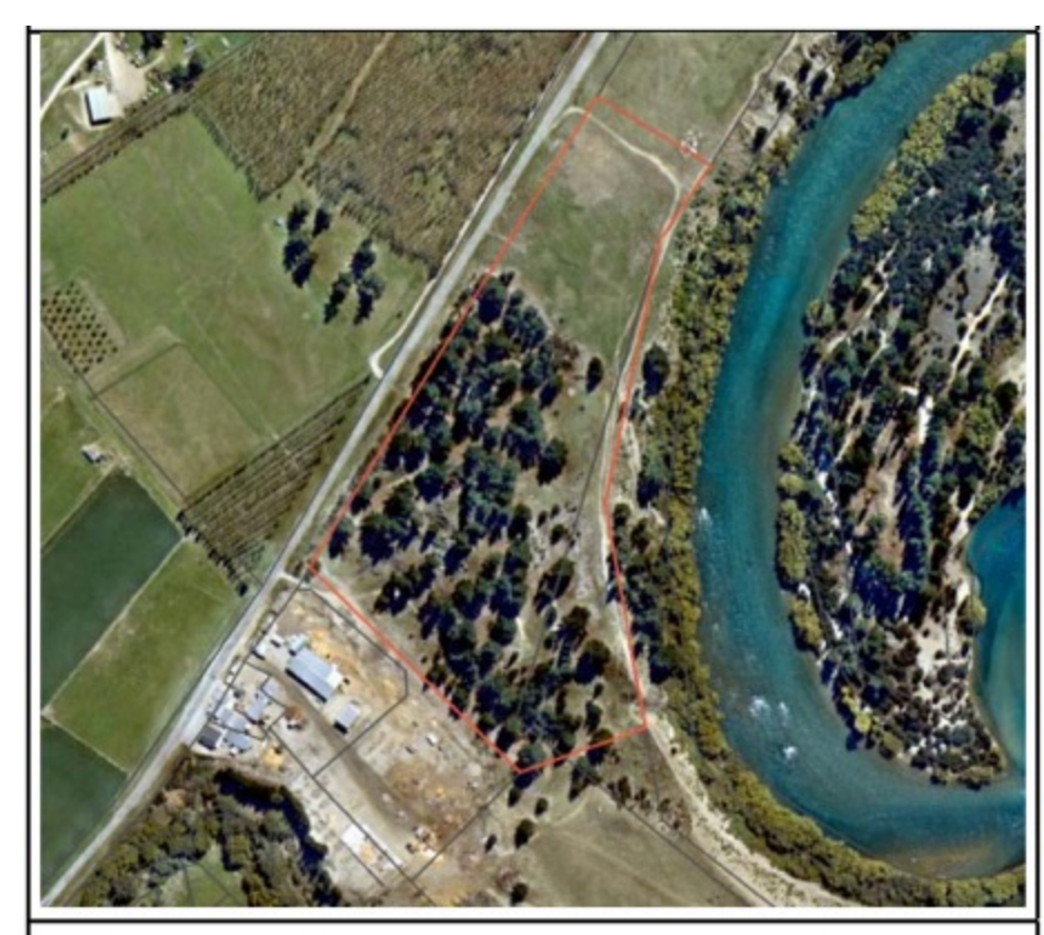
Aerial photo of subject site showing area of re-zoning request from Upper Clutha Transport Limited outlined in red.