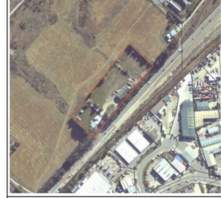
Aerial photo of subject site showing area of re-zoning request outlined in red.

submission and wrapping around and up the eastern elevated base of Queenstown Hill (with views of Lake Hayes) is the established Quail Rise residential neighbourhood. The land that is the subject of the submission was zoned MDRZ in Stage 1 of the PDP (and is under appeal). The extent of MDRZ extends to the south-west and includes a strip of BMUZ land extending west from Hawthorne Drive to Joe O'Connell Drive (from which point a Local Shopping Centre zone centred on the Frankton Road / Kawarau Road roundabout is located).