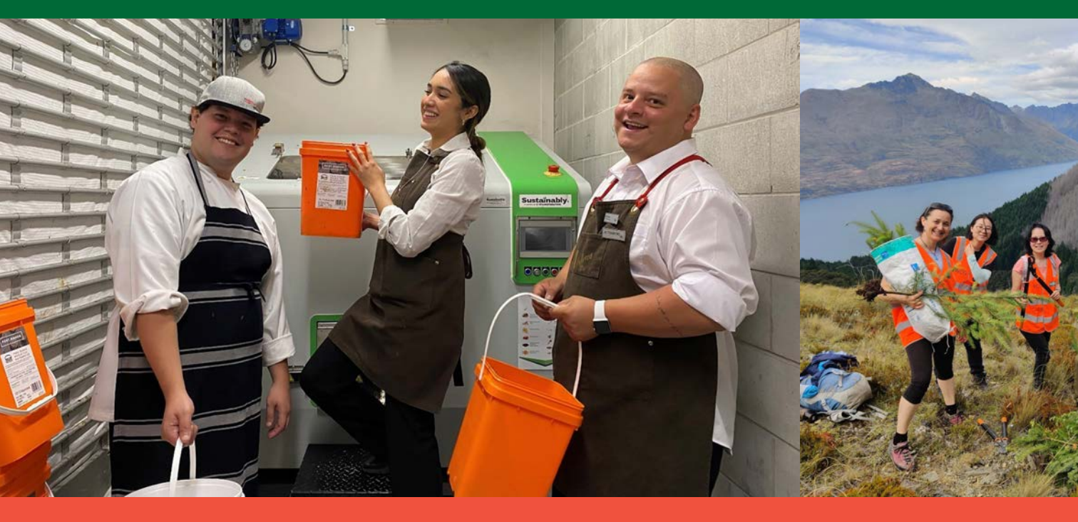
Hilton staff members feed food waste into the dehydrator.

The introduction of the composting programme required some training