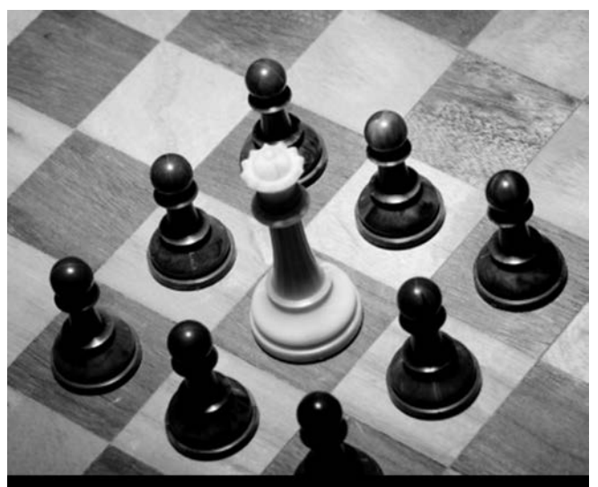
Always outnumbered... never outgunned.

Cold ash can also be spread on a garden as a fertiliser. Just make sure you're not burning treated wood.