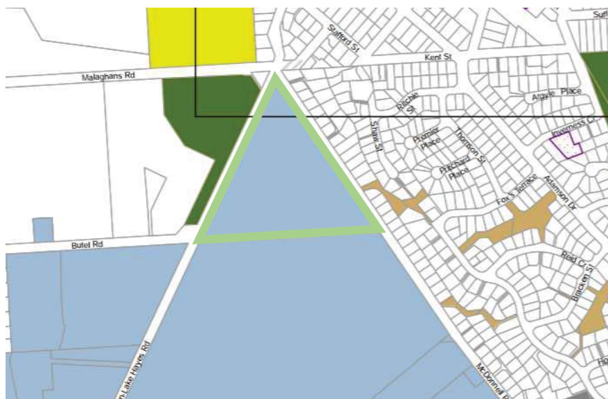
Figure 1: Stage 2 PDP zoning - the land the subject of this submission is identified in green outline