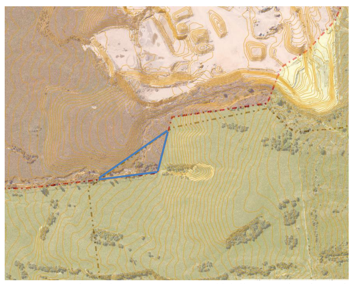
Figure 1 : QLDC Proposed District Plan Decisions Version mapping. Red dashed line corresponds to Urban Growth Boundary . Brown dashed line corresponds to ONL boundary .

3.3 The application of this policy approach across the District has led to a general preference to delineate UGBs outside of ONF/Ls<sup>2</sup> which makes sense from a landscape perspective, as it avoids the competing imperatives of enabling urban development and protecting landscape values.