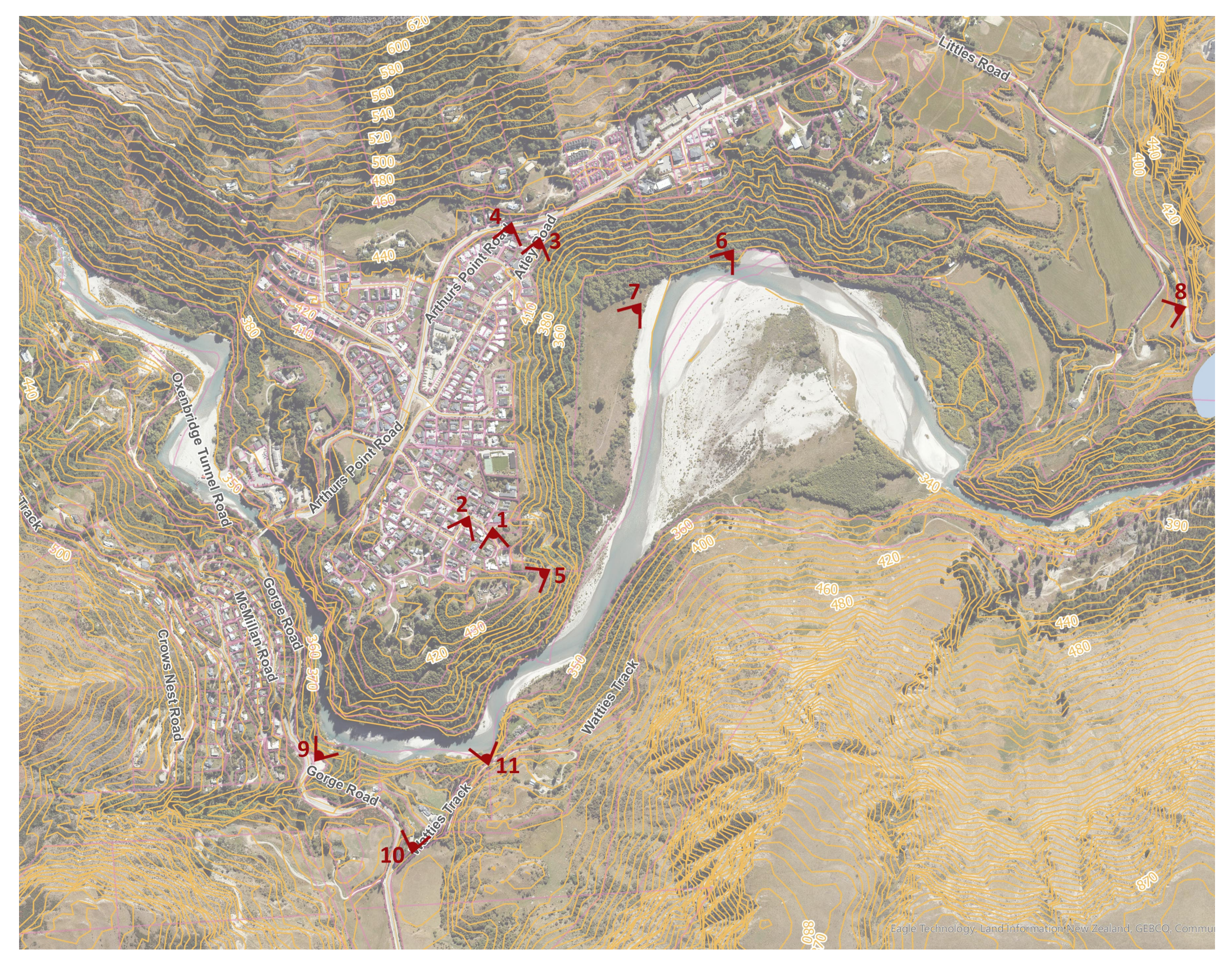
Figure 7: Photograph location map