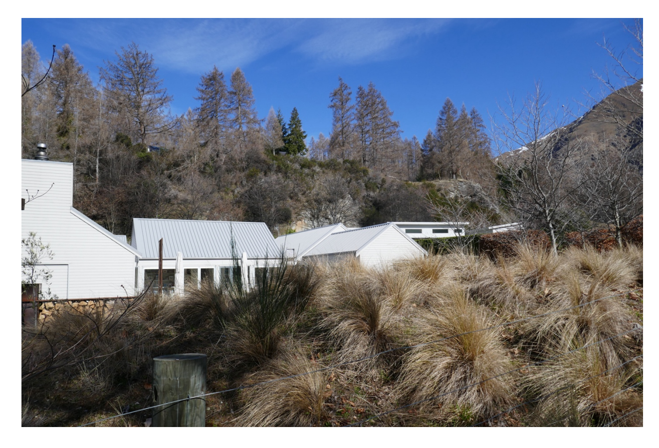
Photograph 2: View from corner of Larkins Way and Larchmont Close towards knoll (August 2022)