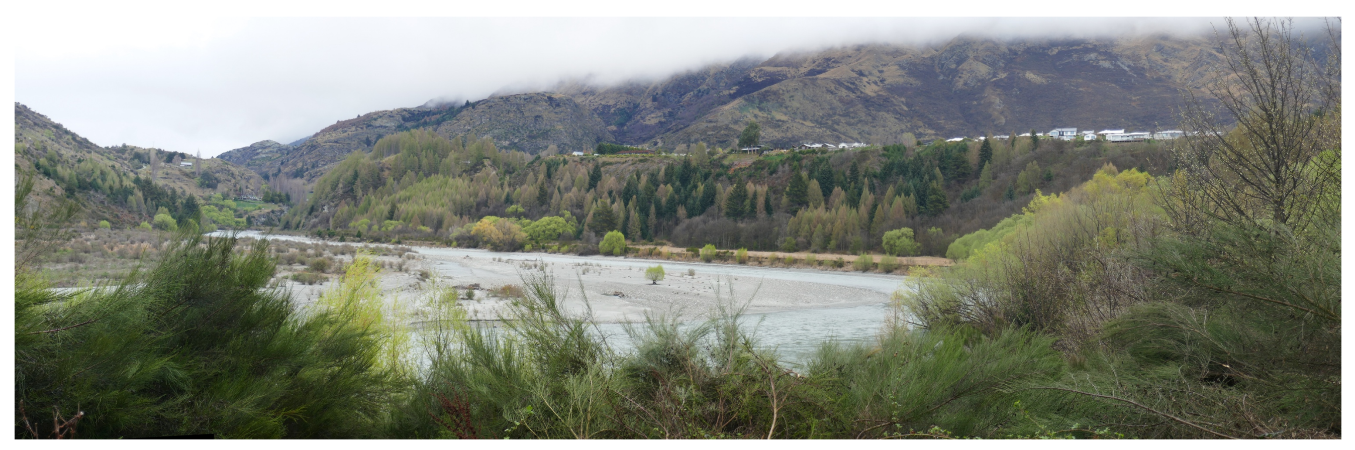
Photograph 6: View towards knoll from walkway to river at northern end of Atley Road (panorama stitched from 2 landscape photographs, Sep 2022)