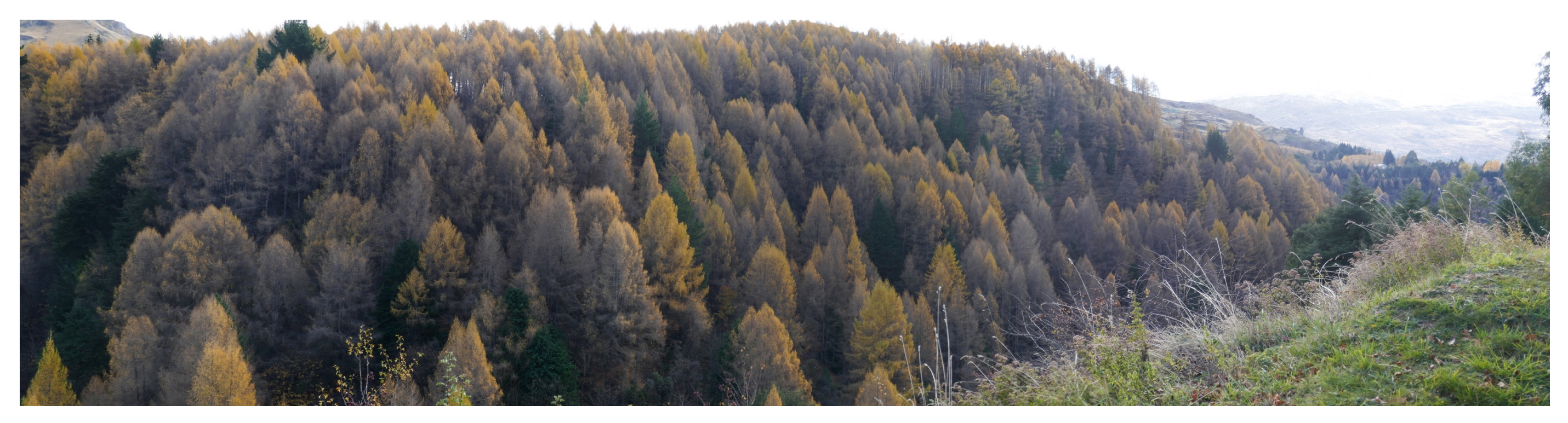
Photograph 10: View towards knoll from eastern end of the public section of Watties Track (panorama stitched from 3 50mm equivalent landscape photographs taken in May 2022).