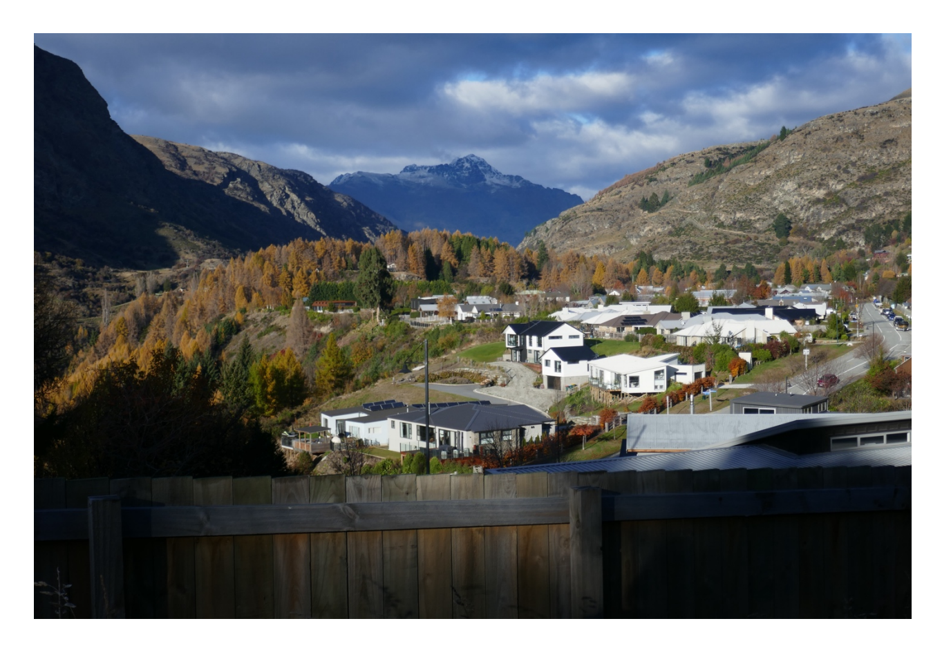
Photograph 4: View from Arthurs Point Road north of Altey Terrace towards the knoll (May 2022)