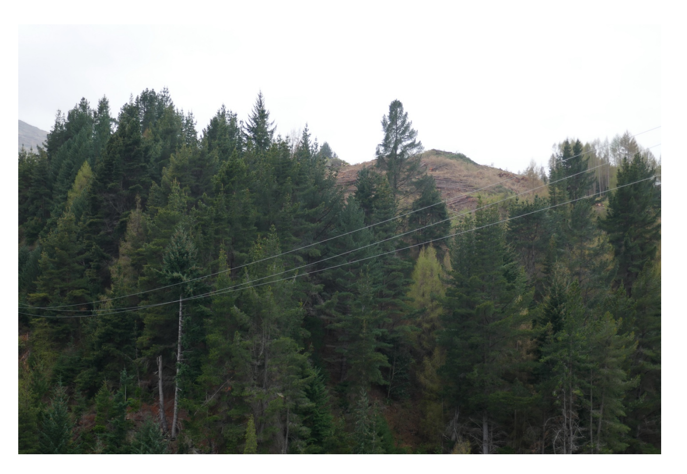
Photograph 9: View from Gorge Road near former Arthurs Point Tavern site towards knoll (Sep 2022)