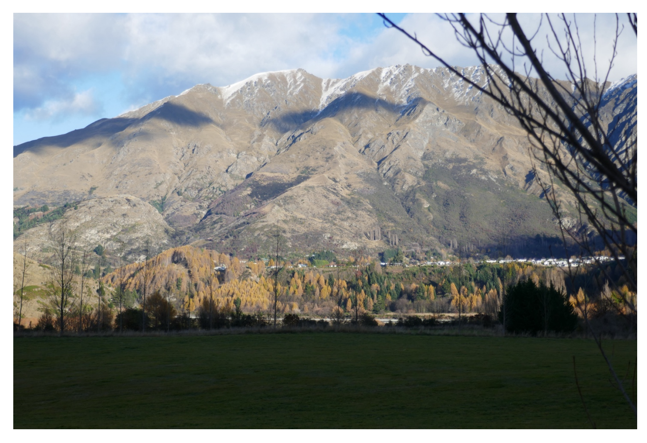
Photograph 8: View from Littles Road towards knoll and Atley Terrace (May 2022)