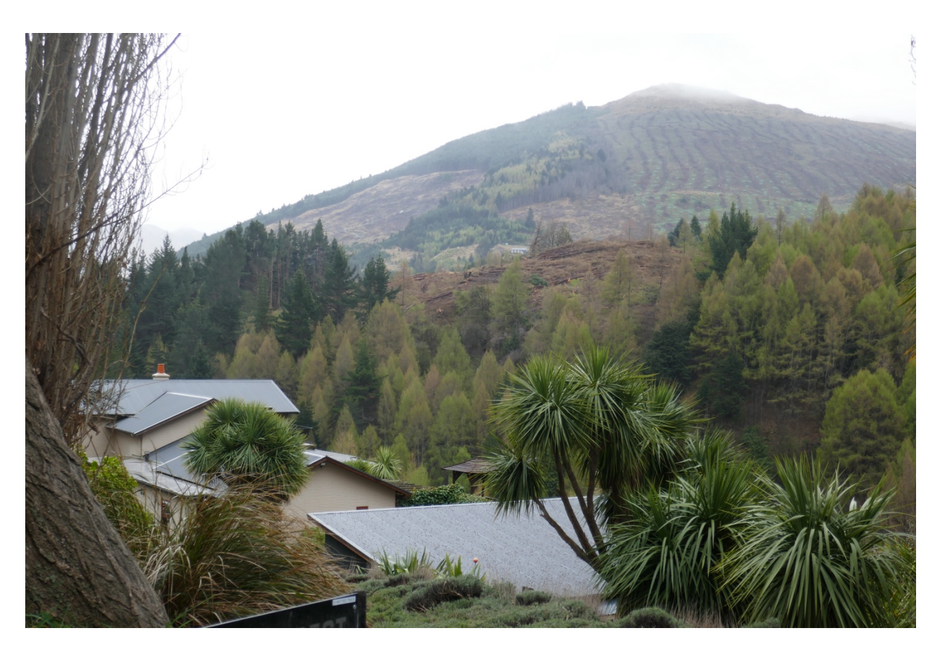
Photograph 10: View from Watties Track, adjacent to No. 3 towards knoll (Sep 2022)