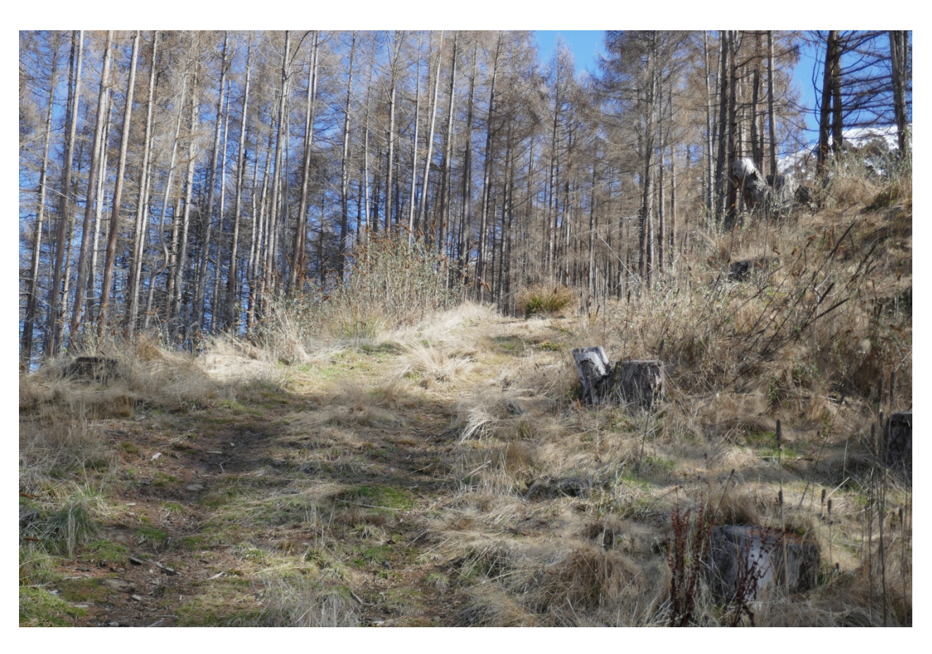
Photograph 5: View from lookout on DOC reserve (accessed by walkway from the end of Larkins Way) towards rezoning site (August 2022 approx. 30m from viewpoint)