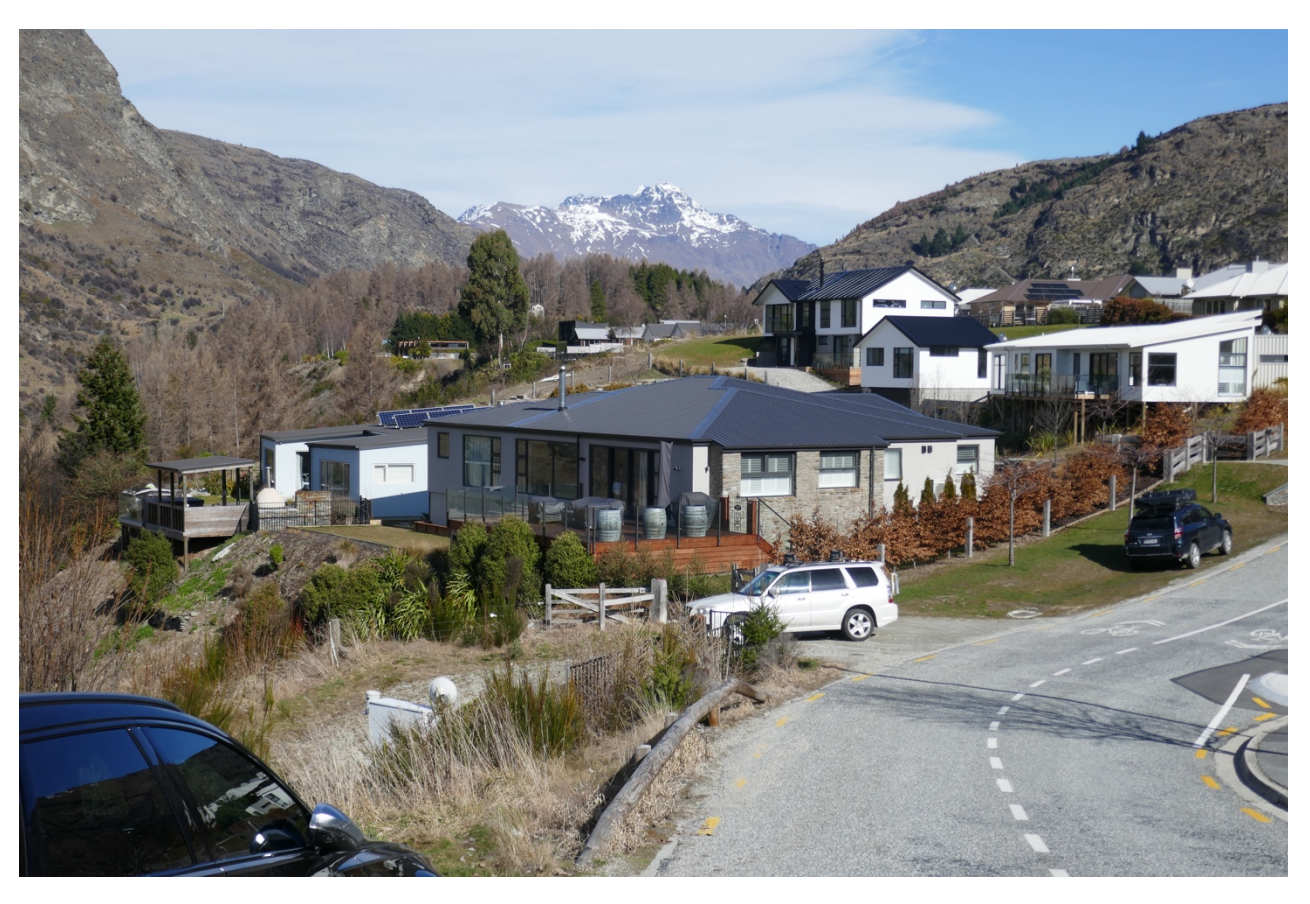
Photograph 3: View from northern end of Altey Road towards knoll (August 2022)