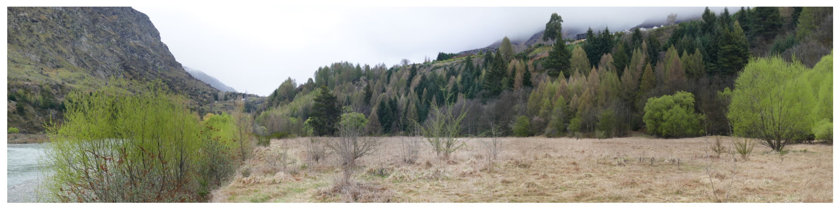
Photograph 7: View towards knoll from floodplain adjacent to river (panorama stitched from 3 landscape photographs, Sep 2022)