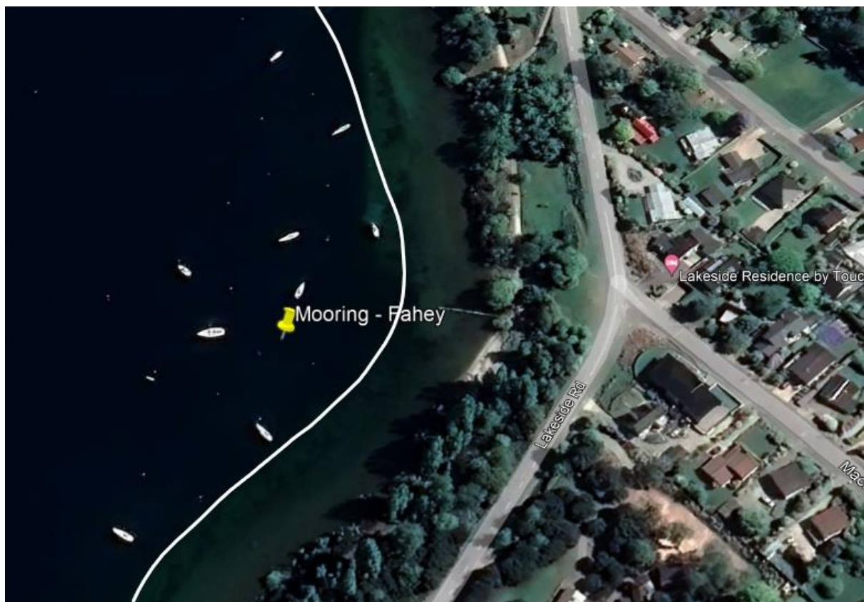
Figure 1: Aerial image of the subject site

The site is located within Roy's Bay, Lake Wanaka. An image of the location can be seen below in Figure 1.