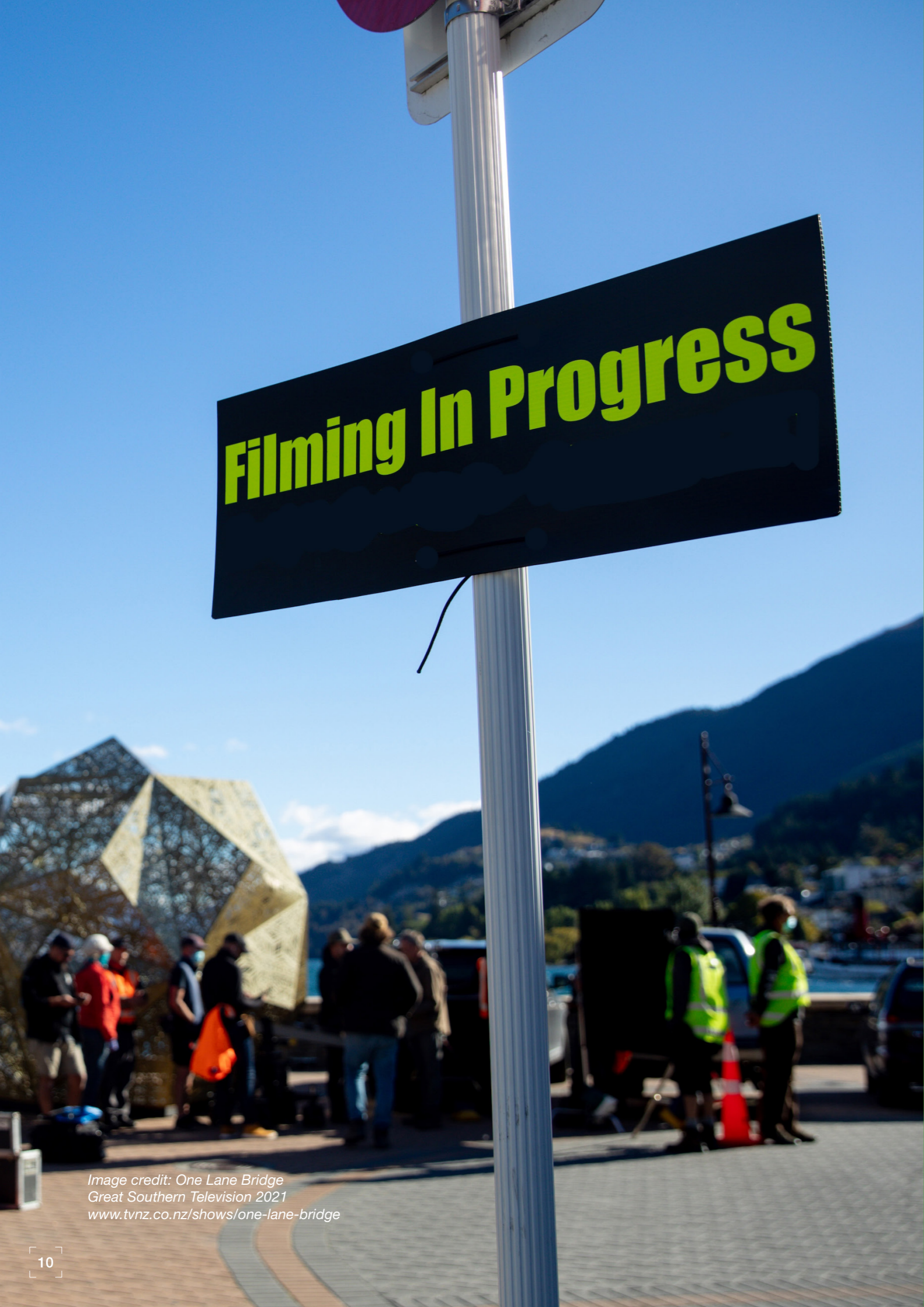
Image credit: One Lane Bridge Great Southern Television 2021 www.tvnz.co.nz/shows/one-lane-bridge