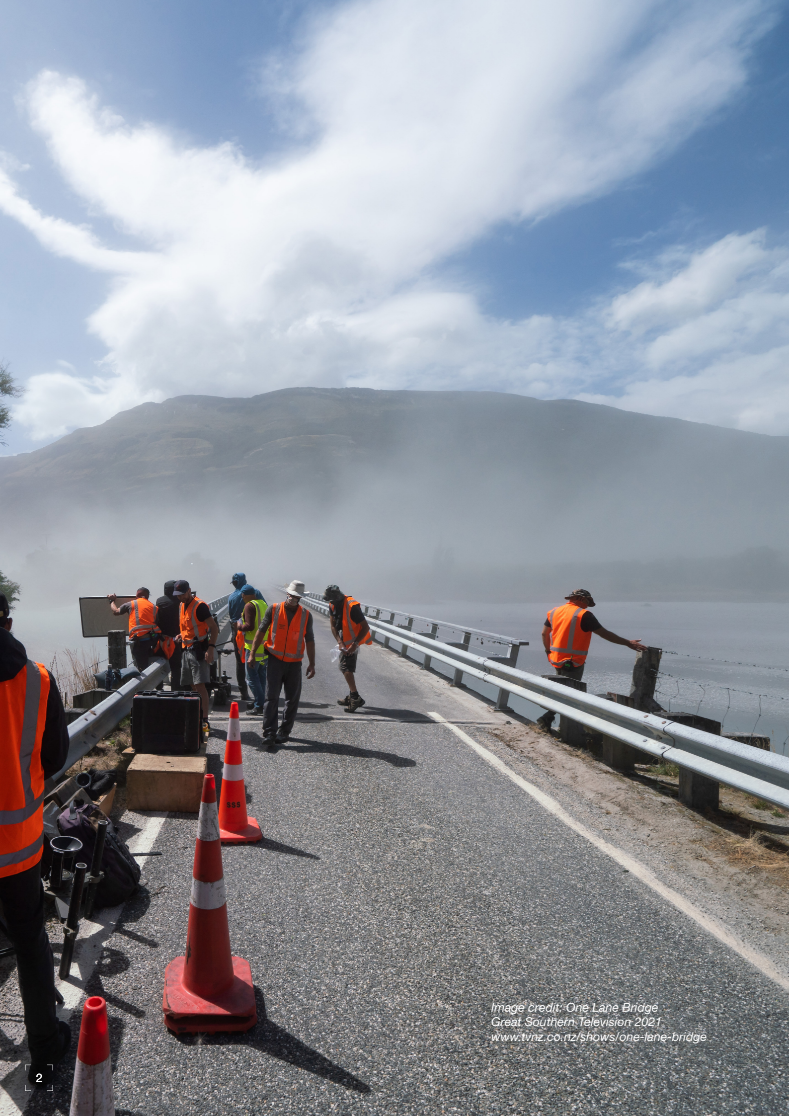
Image credit: One Lane Bridge Great Southern Television 2021 www.tvnz.co.nz/shows/one-lane-bridge