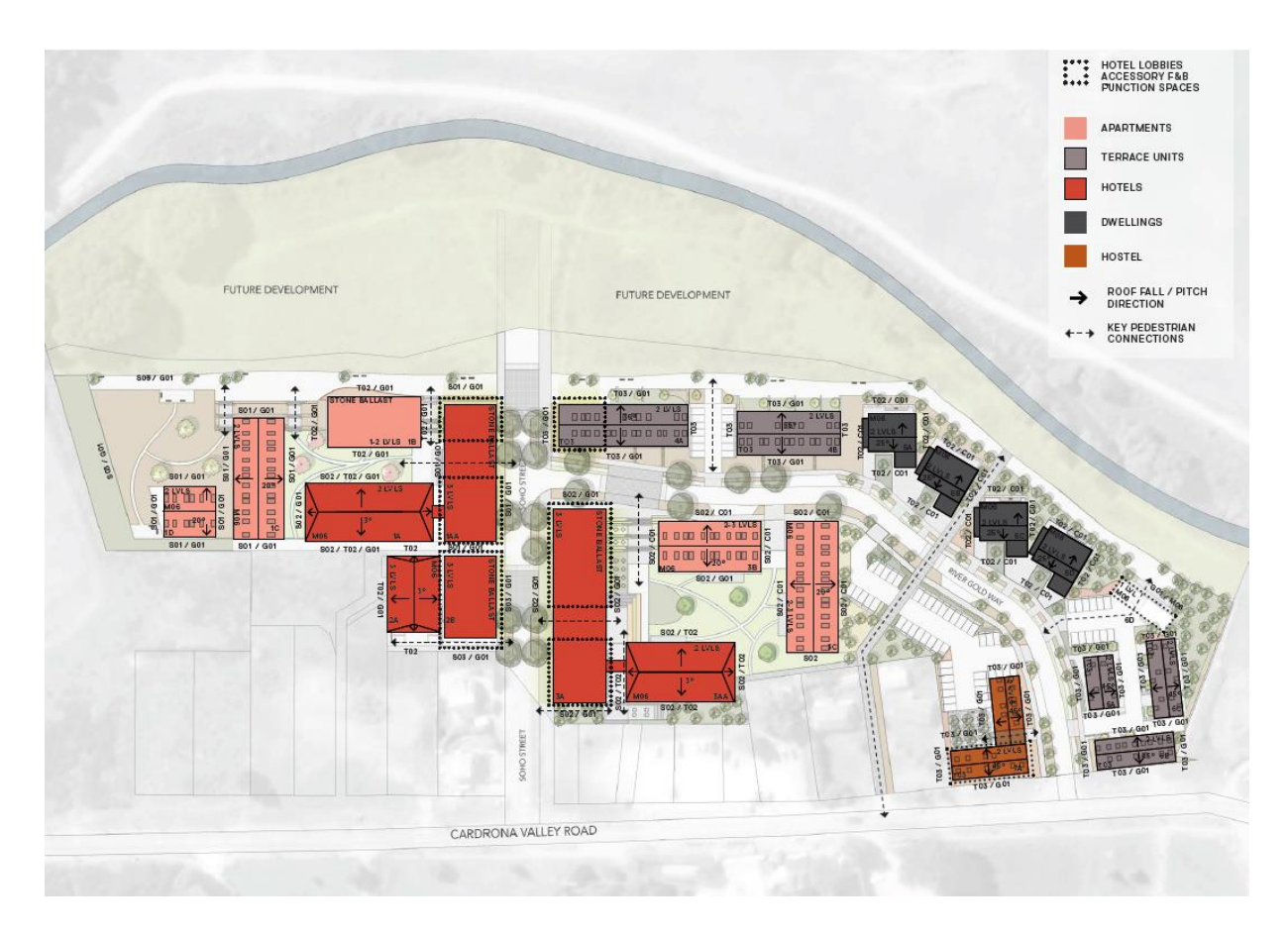
Figure 3 – Schematic of Development Intended for the Submitters Land at Cardrona

11. The intended comprehensive development of the Submitters land provides for centralised services and facilities accessory to the proposed hotel activities at the Soho Street / Rivergold Way hub of the proposed development. These activities will comprise of cafes, restaurants and shared function spaces. It is therefore logical to extend the Commercial Precinct along both sides of Soho Street from Cardrona Valley Road to cover these likely future activities. The extension of the Commercial Precinct will provide for recognition of the visitor hub that is intended to be created by the Submitter around the intersection of Soho Street and Rivergold Way at Cardrona in the future.