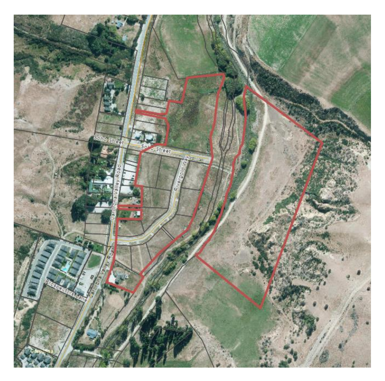
Figure 1 - The Submitters Land

longer aligned with the banks of the river. The Submitter has agreed with the Crown to exchange land that is located adjacent to the Cardrona River to ensure that the esplanade reserve is realigned to the new course of the river. This land exchange process has not yet been completed.