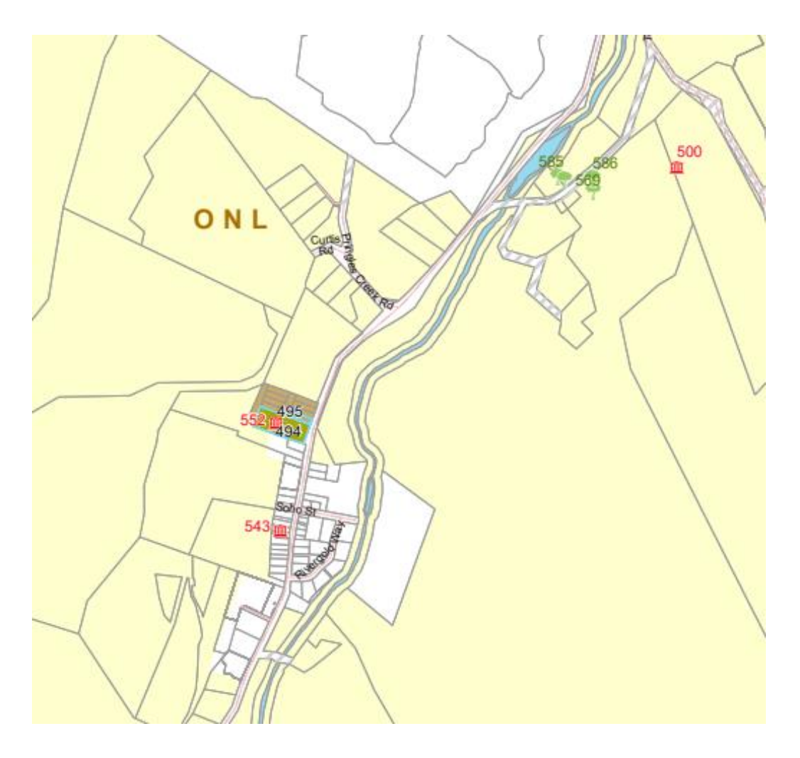
Figure 4 - Copy of PDP Decision Version Map 24 - Cardrona

activities for more than 150 years and currently services the major visitor and tourist attractions in the area, being the Cardrona Alpine Resort downhill ski runs and terrain parks to the north-west, the Snow Farm New Zealand cross-country ski trails to the north-east and the Cardrona Distillery some 2km to the north on Cardrona Valley Road. While the rural area and the ranges beyond the village have long been recognised as an Outstanding Natural Landscape, the Cardrona Village has consistently been recognised as not itself being an ONL, although it sits within the ONL. The operative Rural Visitor Zone has long provided for an urban settlement at this location, and those future outcomes are relevant to the question of whether the land is itself an ONL. This position appears to be supported by the direction that has been taken for the operative Rural Visitor Zone at Cardrona under the proposal, which has rezoned this area as Settlement Zone, rather than retain this area within the new Rural Visitor Special Zone, which has been used for specific visitor industry facilities located in the rural area within the ONL, rather than established rural settlements.