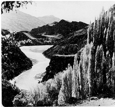
Looking up the Shotover River to Big Beach in South Otago.

ARTHURS POINT, SHOTOVER RIVER, QUEENSTOWN, N.Z. In the distance is seen Coronet Peak, a popular ski resort. From the river flat a very large amount of gold was obtained by a Chinese prospector.