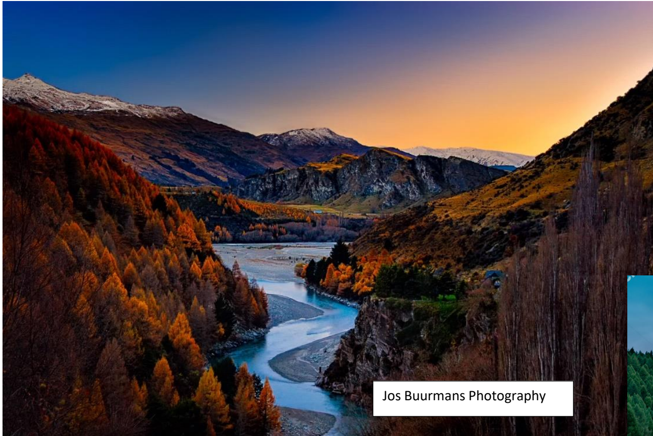
Jos Buurmans Photography