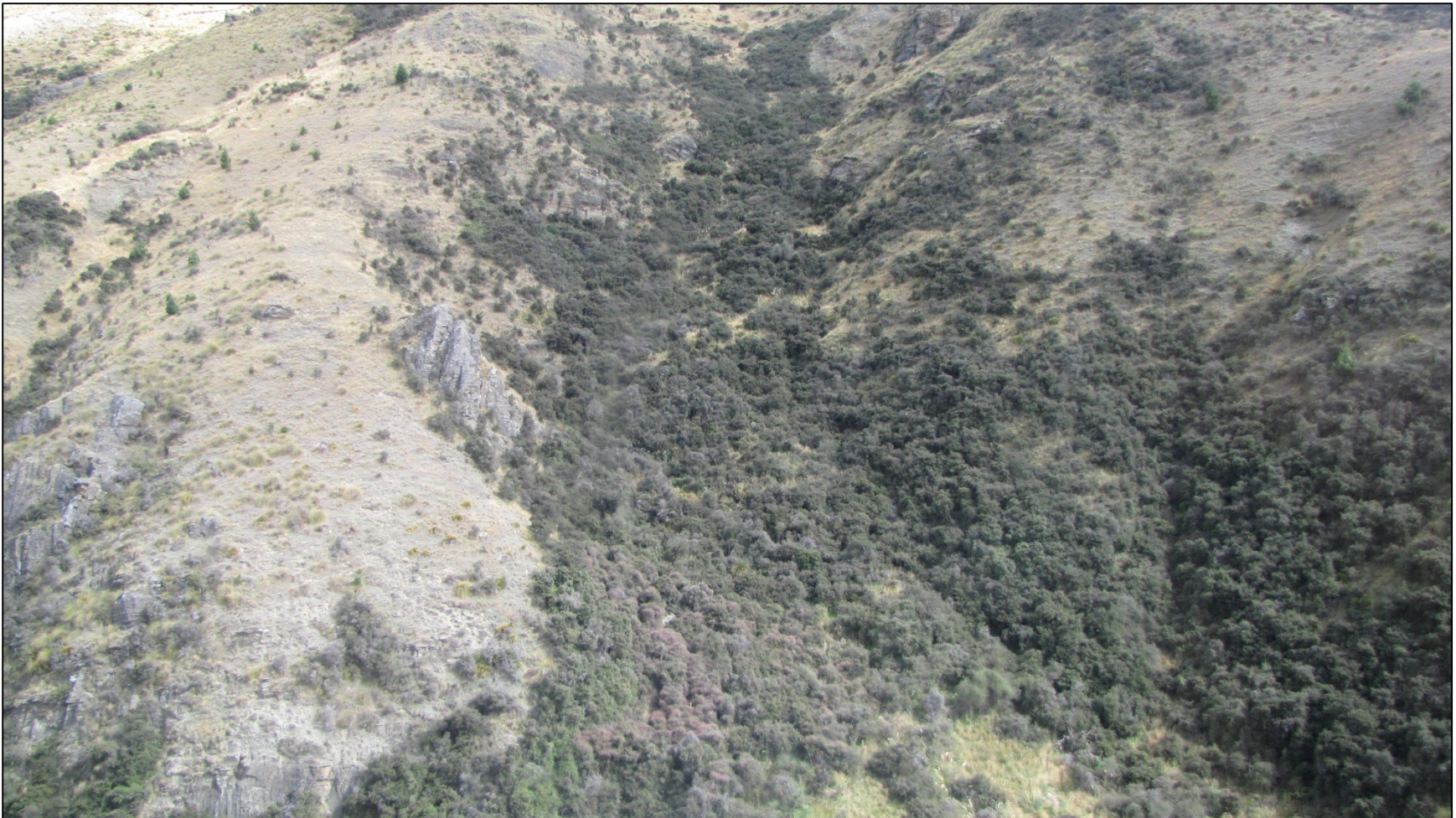
Figure 3: Vegetation within the Owen Creek area.