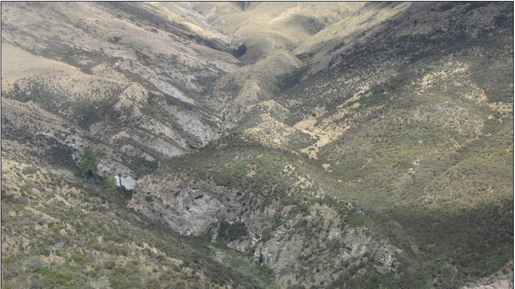
Figure 2: Vegetation within the Owen Creek area.