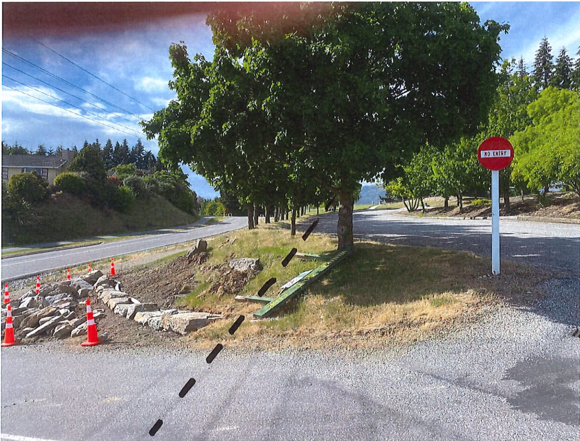
Photo of Work in Progress 17/11/21