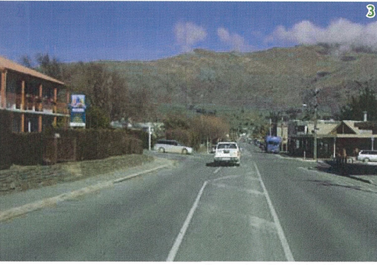
Brownston Street looking west