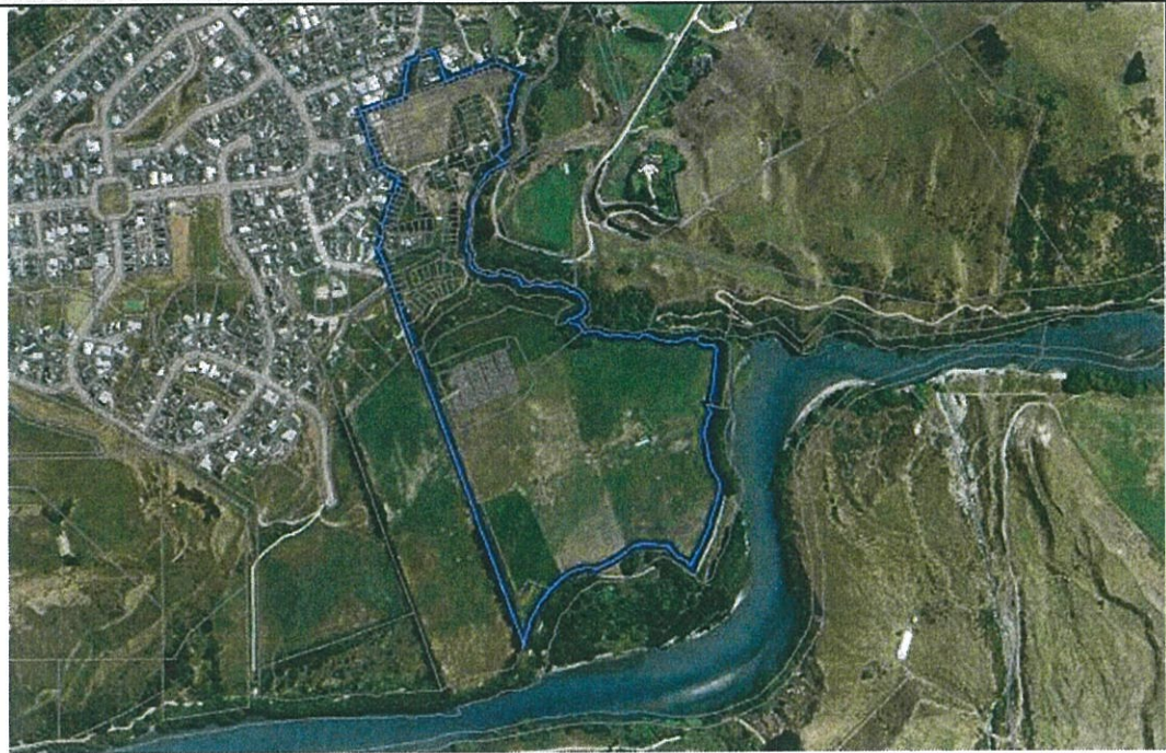
Figure 21: Extent of the proposed re-zoning shown over an aerial photo