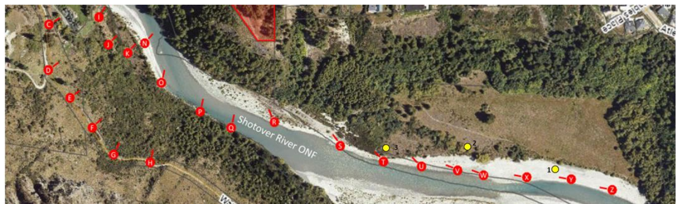
Photo locations plan: the three yellow spots indicate the locations from which the following three photographs were taken. The viewpoint plan from Mr Semple's evidence has been used as a base so my viewpoints can be related to his.