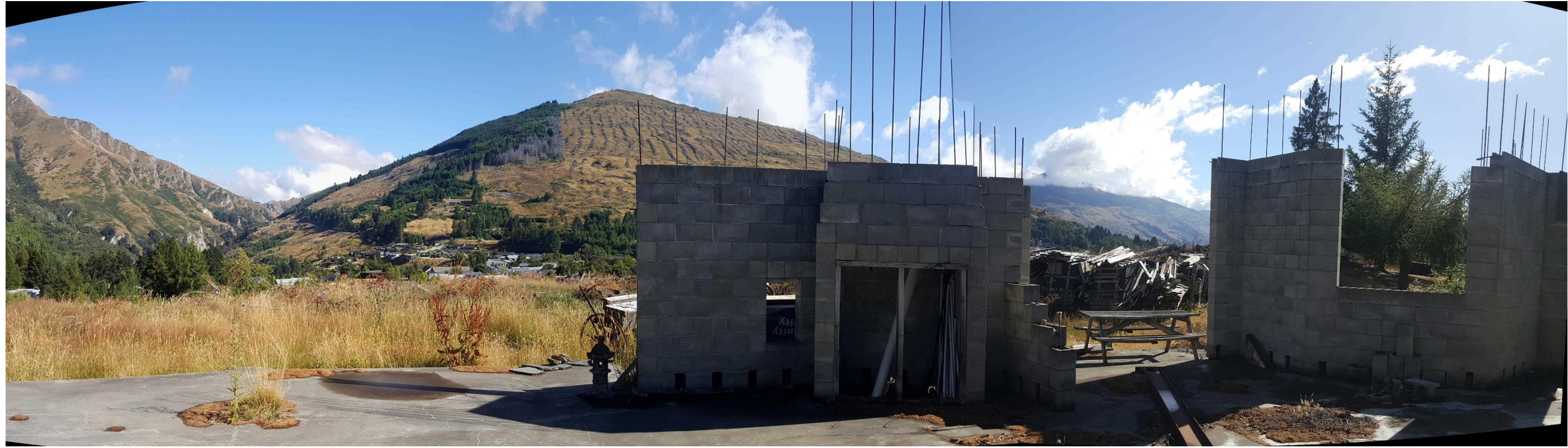
Photograph A: Taken standing on the northeastern corner of the building platform on proposed Lot 41. The walls and floor pad of the partially built dwelling (RM980348) extend approximately 8m to the north of the northern edge of the building platform. The upper edge of the escarpment is approximately 20m to the north of the northern edge of the platform.