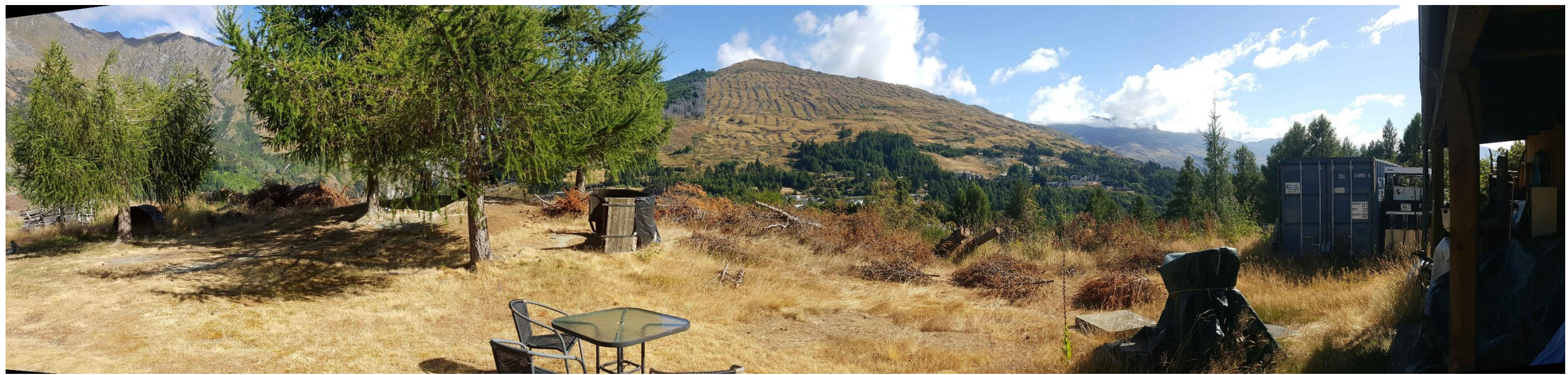
Photograph B: Taken standing on the northwestern corner of the building platform on proposed Lot 39. The upper edge of the escarpment is approximately 14m to the north of the northern edge of the platform.