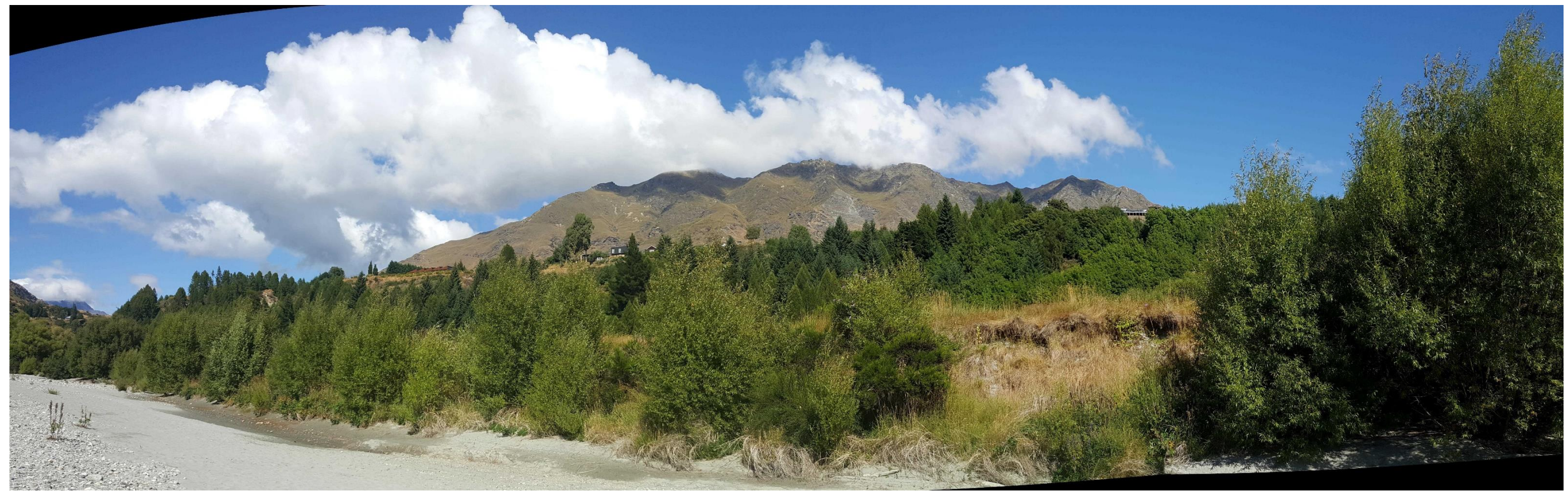
Photograph 1: Near Mr Semple's Viewpoint Y. The subject site is on the extreme left of the flat terrace, behind the treed hills that lie to the site's immediate northeast. No building platform profile poles were visible from this location. Existing built development in Central Arthur's Point can be seen on the edge of the terrace above the viewer.