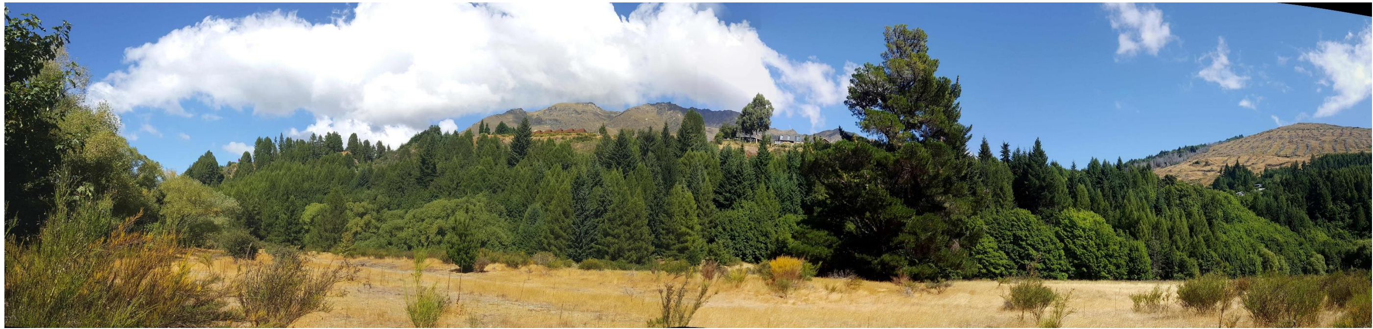
Photograph 2: Near Mr Semple's Viewpoint V. Again, the subject site is on the extreme left of the flat terrace. One profile pole, marking the building platform on Lot 38 of the GSL/LEL relief could be seen (highlighted in red). Again, existing built development in Central Arthur's Point can be seen.