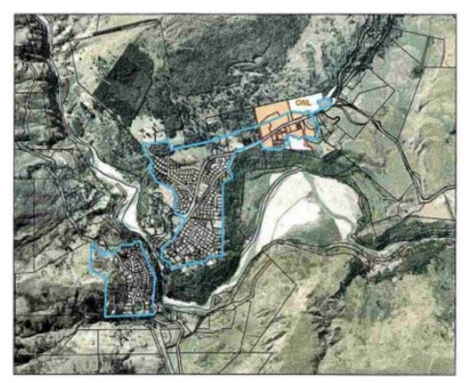
Location of ONL boundaries as proposed by Arthurs Point Outstanding Natural Landscape Incorporated (Figure 2 of their submission).

24. On the south side of Arthurs Point North, the Society's proposed ONL line would exclude an area on the south-east corner of Arthurs Point North with a notified MDRZ zoning.