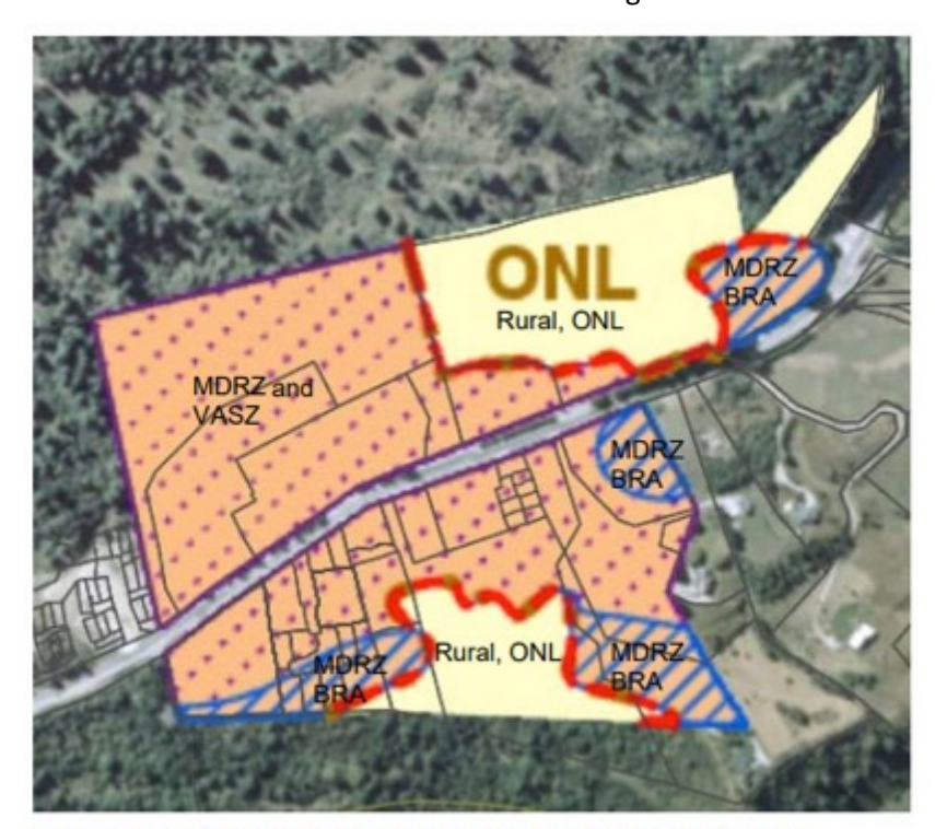
Notified PDP Zoning of Arthurs Point North as part of 3b of the Proposed District Plan.

10. Within the Arthurs Point North area, however, four separate areas were identified where a Building Restriction Area (BRA) should be applied as an overlay on the MDRZ. The VASZ was not applied to those areas. In addition, two areas were excluded from the proposed urban zoning with a Rural zoning and ONL classification applied to them, one on the north-east side of Arthurs Point North and the other on the southern margin of Arthurs Point North.