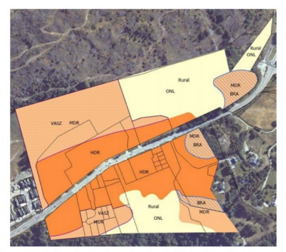
Recommended mapping (zoning and overlays) of Emma Turner for Arthurs Point North. Snip taken

14. The end result is that Ms Turner recommended a mix of zonings as shown in the figure following.