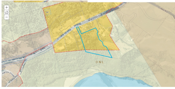
Figure 4-10 – Extract from Planning Map 39. RV Zone is yellow, Rural zone is cream.