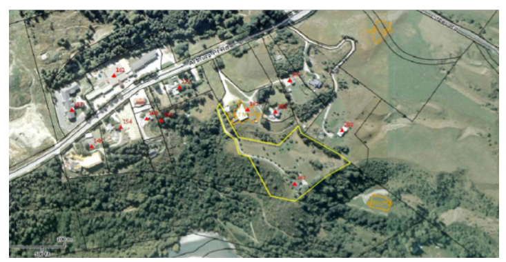
Figure 4-7 – Submission site

85. The site is on the southern side of Arthurs Point Rd towards the eastern end of the settlement. It contains 2.117ha. There is one existing house on it.