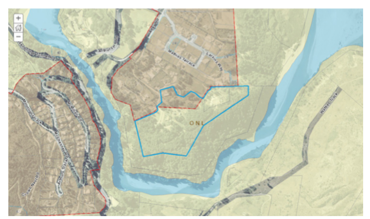
Figure 4-4 – Extract from Planning Map 39 - Red line as UGB, Cream is Rural Zone Light brown is LDR Zone, Blue line is subject site.

45. The requested rezoning could yield 89 lots (based on 450m2 per lot).