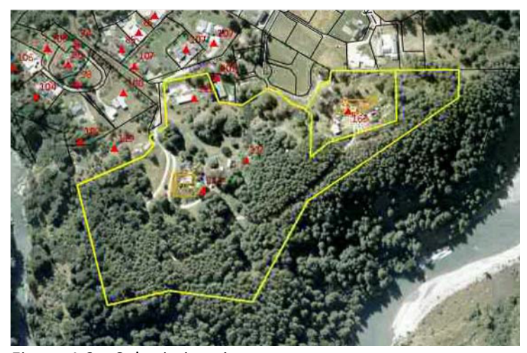
Figure 4-3 – Submission sites

43. The properties are situated on the eastern and northern sides of the Shotover River, adjacent to the settlement of Arthurs Point. The properties are shown on Figure 4-3 below.