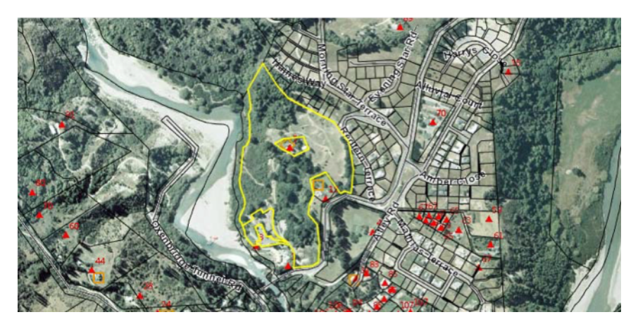
Figure 4-1 – Submission site

2. The site is on the east bank of the Shotover River just to the north of the Edith Cavell Bridge. It is shown on Figure 4-1 below