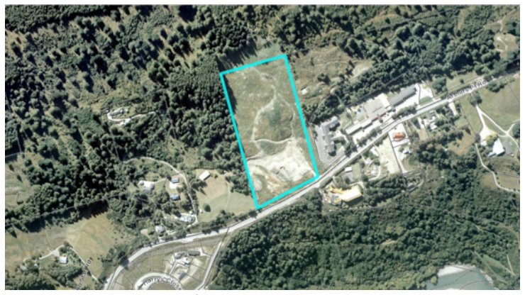
Figure 4-5 – Submitter's Property