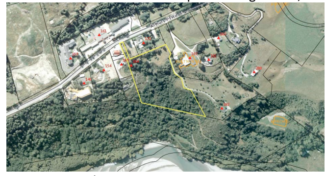
Figure 4-9 – Submission Site