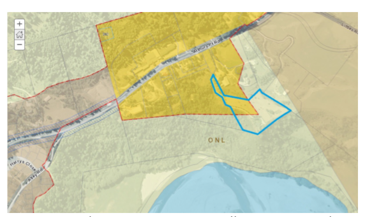
Figure 4-8 – Planning Map extract. Yellow is ODP Rural Visitor Zone, cream is Rural