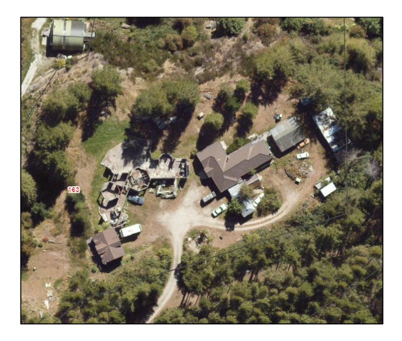
Figure 2: The Castle at 163 Atley Road

5.7 From my reading of the evidence for the submitter, reliance is being placed on this consent having been exercise and therefore its ability to be fully implemented and bring about adverse effects is 'live'. However, it appears to me the trees that were to be protected (by way of consent condition)<sup>3</sup> for screening of the buildings from outside of the Site have been removed as part of the vegetation clearance of the Site.