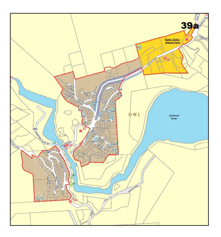
Figure 1: Notified PDP Map 39a (Arthurs Point)