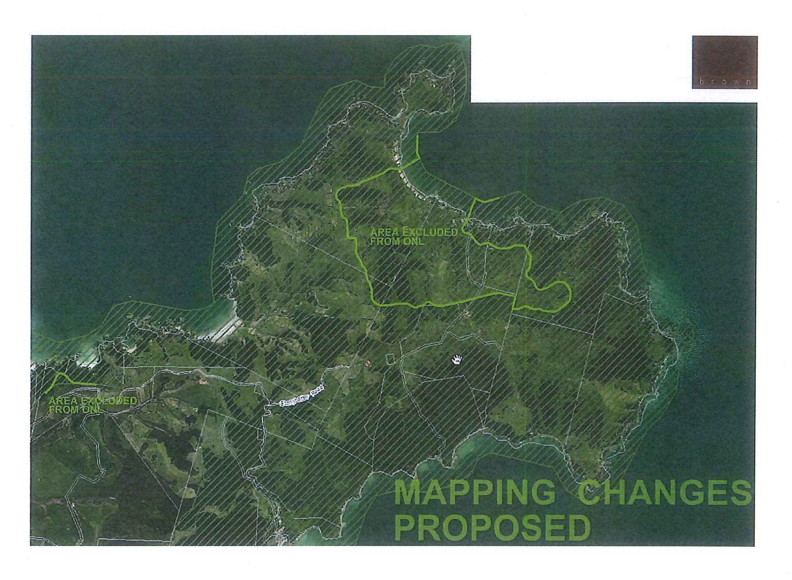
Re-alignment of ONL78 to accord with Environment Court Decision [2014] NZEnvC 167