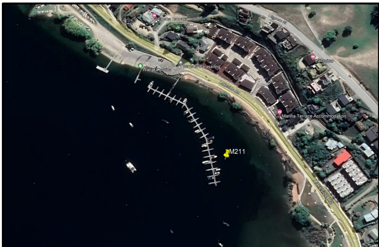
Figure 1: Aerial image of the subject site (yellow pin).

The site is located within Roy's Bay, Lake Wanaka. An image of the coordinate position, as per the permit, can be seen below in Figure 1. The actual mooring, however, is positioned just off the pin below, towards the shore line slightly.