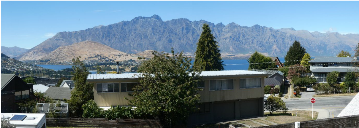
Current view from ground floor at 8B Wynyard Crescent, Fernhill (May 2025)